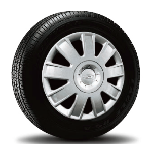
15" Steel Wheel with 9-Spoke Appearance Cover