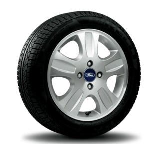
16" 5-Spoke Machined Aluminum Wheel with Argent Pockets