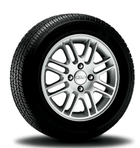
15" Multi-Spoke Aluminum Wheel