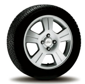
16" 5-Spoke Aluminum Wheel