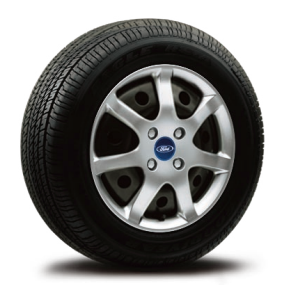
15" Steel Wheel with 7-Spoke Appearance Cover