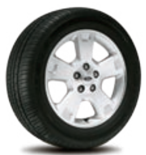
17" Aluminum Alloy Wheels (Late Availability)