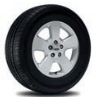
16" Painted Aluminum 5-Spoke Sport Wheel