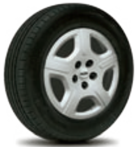
16" Steel Wheel with Full Wheel Cover