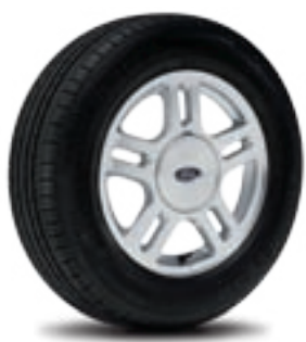
16" Painted Aluminum 5-Spoke Wheel