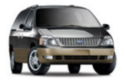
Price: $33,420* EPA: +