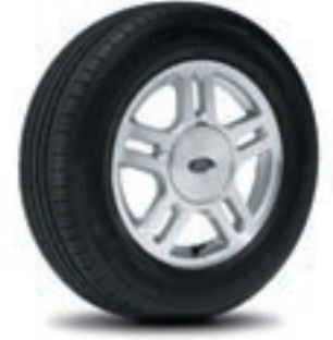
16" Bright Machined Aluminum 5-Spoke Wheel