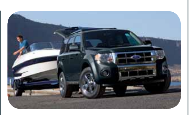
Tow your toys Escape XLT and Limited can tow up to 3500 lbs. when properly equipped with the optional Class II Trailer Tow Prep Package.

The new Escape is bursting with enthusiasm for the open road – especially those twisty, curvy sections. Its retuned, fully independent suspension delivers a smoother, more refined ride than before, while the available Duratec 30–3.0L V6 engine supplies a sporty 200 horsepower to keep you on the move. If maximizing fuel economy is your kind of fun, go for Escape's standard Duratec 23–2.3L I-4 or the ultra-efficient hybrid powertrain. See pages 8–10 for more on Escape Hybrid.