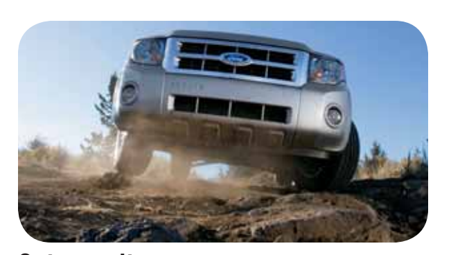
Get over it The new Escape and Escape Hybrid are naturally nimble. Both feature outstanding approach, breakover and departure angle capabilities, so you can drive up and over some formidable obstacles that others will have to drive around.

It's Saturday. It's sunny. You've got to get out. Time to call your friends and hit the road. Or maybe there's no road where you're going. No matter. Escape's optional Intelligent 4WD System is always on and always working. It automatically monitors traction and adjusts torque distribution as needed to give you maximum grip. So go ahead and change course whenever you'd like. Escape is willing and able to take you anywhere your heart desires.