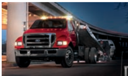
F-650 XLT REGULAR CAB UPFITTED FOR FLATBED TOWING