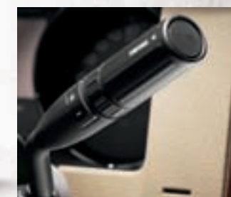
SELECTSHIFT TOW HAUL