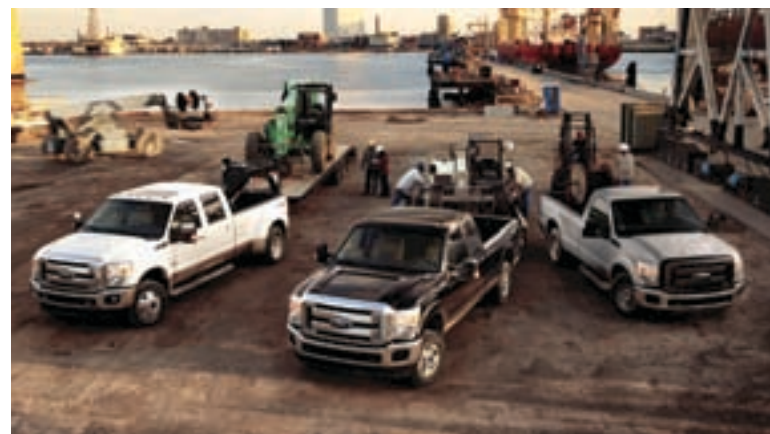
F-450 LARIAT CREW CAB, F-350 XLT SUPERCAB AND F-250 XL REGULAR CAB

Ford Super Duty Pickups work hard – and smart – with best-in-class fuel economy 2 (Gas or Diesel) and best-in-class 5th-wheel towing 3 .