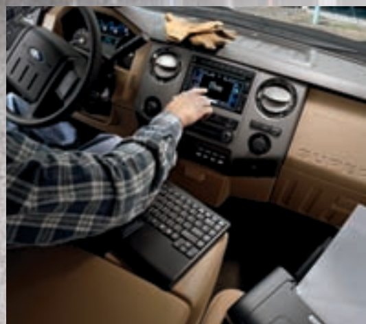
IN-DASH WINDOWS® CE COMPUTER WITH TOUCH SCREEN TECHNOLOGY

➤➤➤ For more information about Ford Work Solutions, visit www.fordworksolutions.com or ask your Ford Dealer.