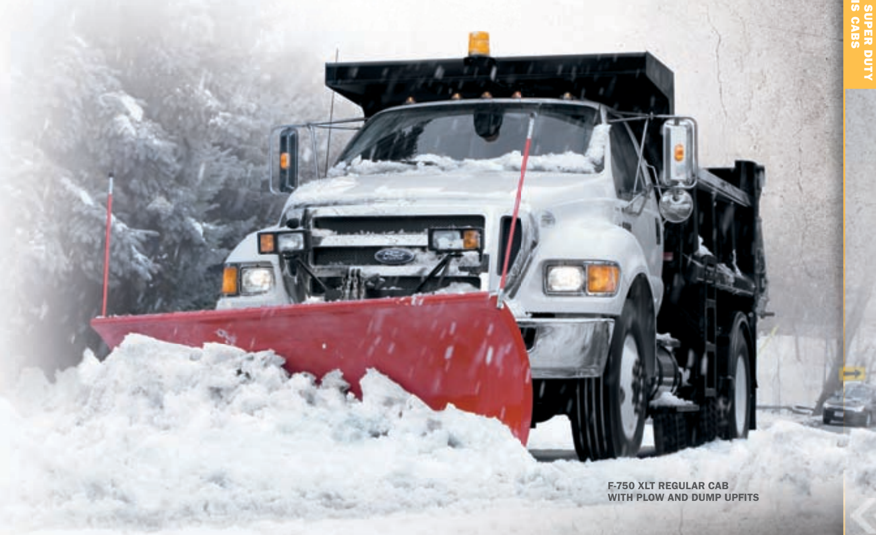
F-750 XLT REGULAR CAB WITH PLOW AND DUMP UPFITS