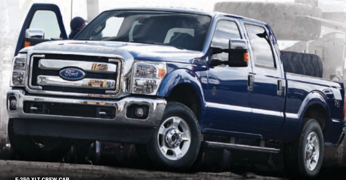
F-250 XLT CREW CAB