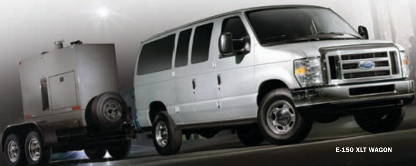
E-150 XLT WAGON