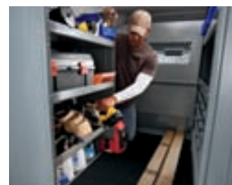
ADRIAN STEEL SYSTEM