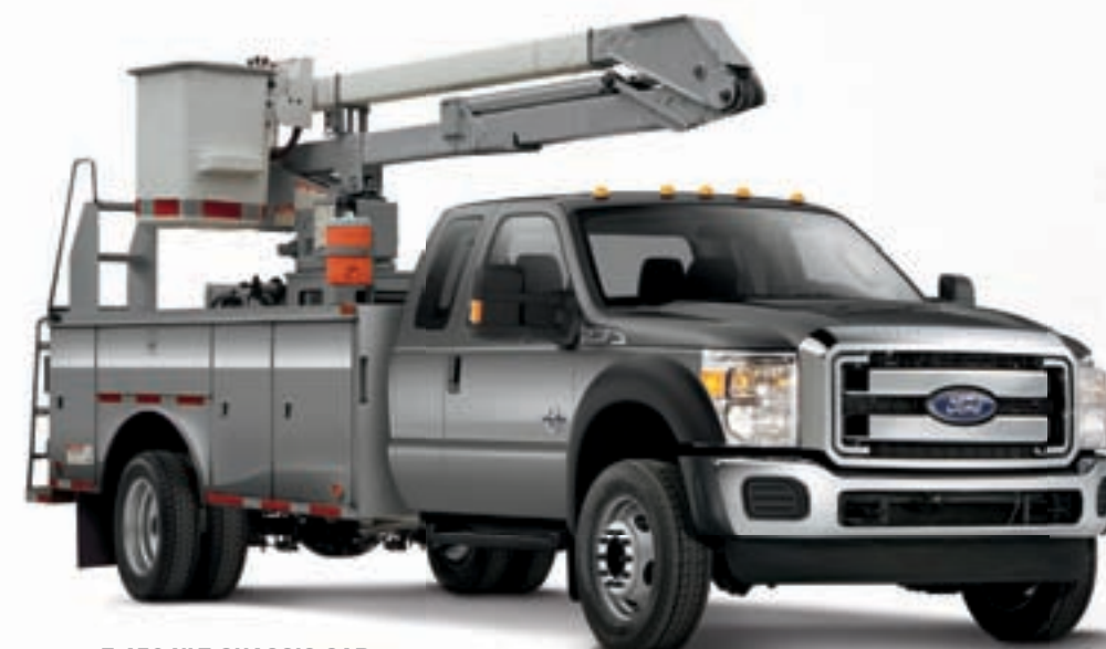
F-450 XLT CHASSIS CAB WITH BUCKET LIFT UPFIT