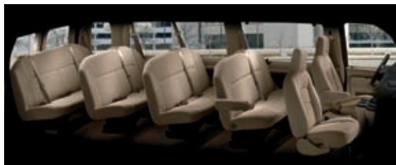
SEATING CONFIGURATIONS FOR UP TO 15

An American favorite year after year, E-Series Wagons offer multiple seating configurations, advanced styling and capability combined with comfort.