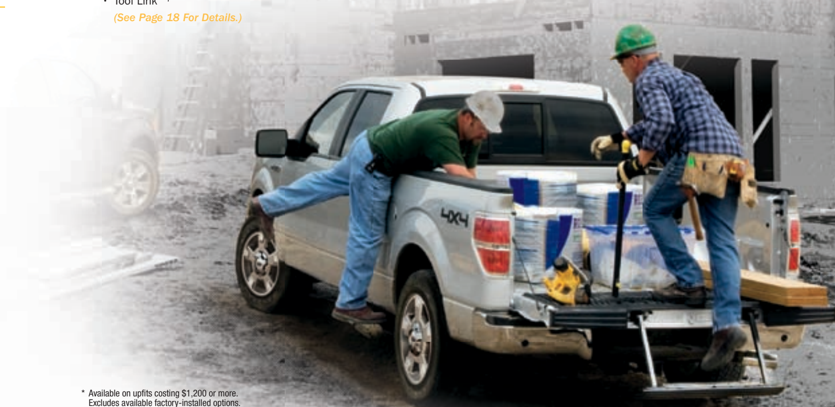
F-150 XLT SUPERCREW