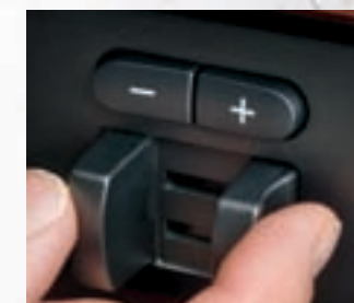
TRAILER BRAKE CONTROLLER