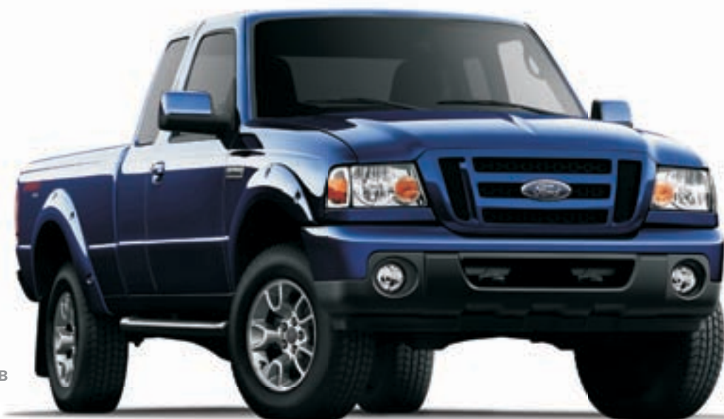
RANGER SPORT SUPERCAB