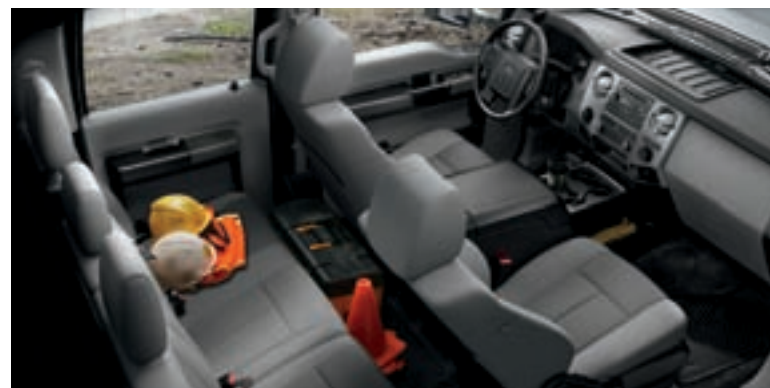
F-350 XLT CREW CAB INTERIOR

All-new 2011 models are more capable than ever, with new engines, Ford TorqShift ® SelectShift Automatic ™ transmissions and a class exclusive 1 Live-Drive Power Takeoff (PTO).