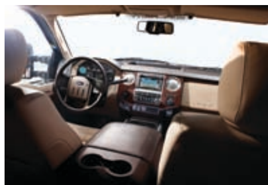
F-350 LARIAT CREW CAB