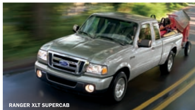
RANGER XLT SUPERCAB

Performs at the pump better than any pickup in America, delivering 22 city/27 hwy mpg 1 . It's also the only compact pickup to offer a 7-ft. cargo box for fleet customers.