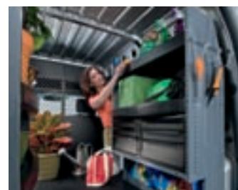
LEGGETT & PLATT SYSTEM