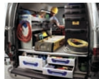
SORTIMO INTERIOR SYSTEM