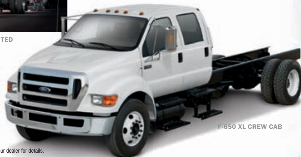
F-650 XL CREW CAB