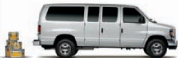
E-350 XLT WAGON