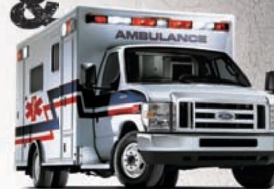
E-450 SUPER DUTY CUTAWAY