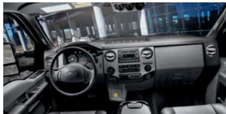
F-650 XLT CREW CAB INTERIOR

A huge range of upfit possibilities, Cummins® Turbo Diesel and your choice of Allison® and Eaton Fuller® transmissions 1 – all part of what makes F-650 and F-750 Super Duty Chassis Cabs some of the most depended-on commercial vehicles in America.