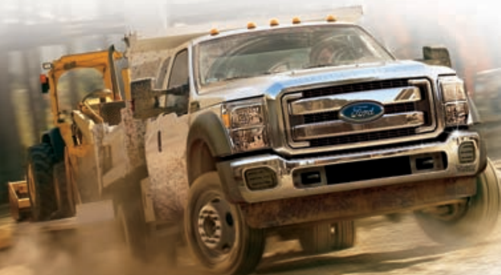
F-550 XLT CHASSIS CAB WITH DUMP UPFIT