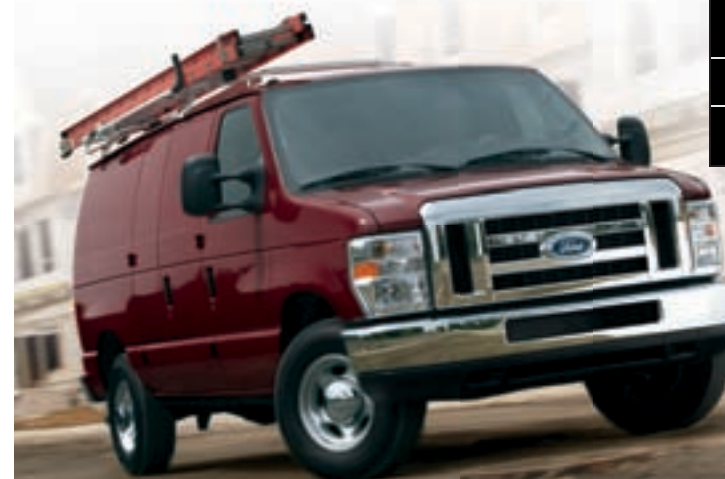
E-250 CARGO VAN UPFITTED WITH A LOCKABLE LADDER RACK AND CROSSBOW