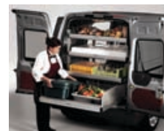
KATERACK INTERIOR SYSTEM