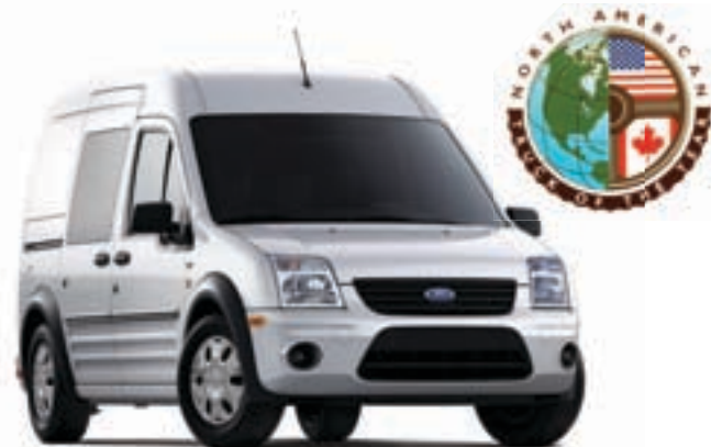
TRANSIT CONNECT XLT VAN

Available in a variety of Van and Wagon configurations, Transit Connect fits in city alleys and parking structures, and gets best-in-class 1 fuel-economy – a combined 23 mpg 2 .