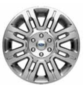
20" Polished Aluminum Optional