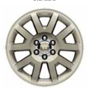
20" Premium Painted Aluminum with King Ranch Center Caps Optional