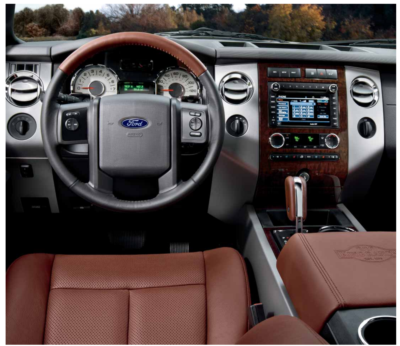
Chaparral leather trim with perforated inserts. Available equipment. Chaparral leather trim with perforated inserts. 2nd-row bucket seats! Available equipment. Ist- and 2nd-row carpeted floor mats. Front fender and liftgate logos.