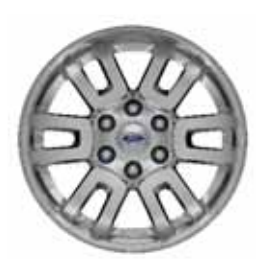
18" Machined Aluminum Standard