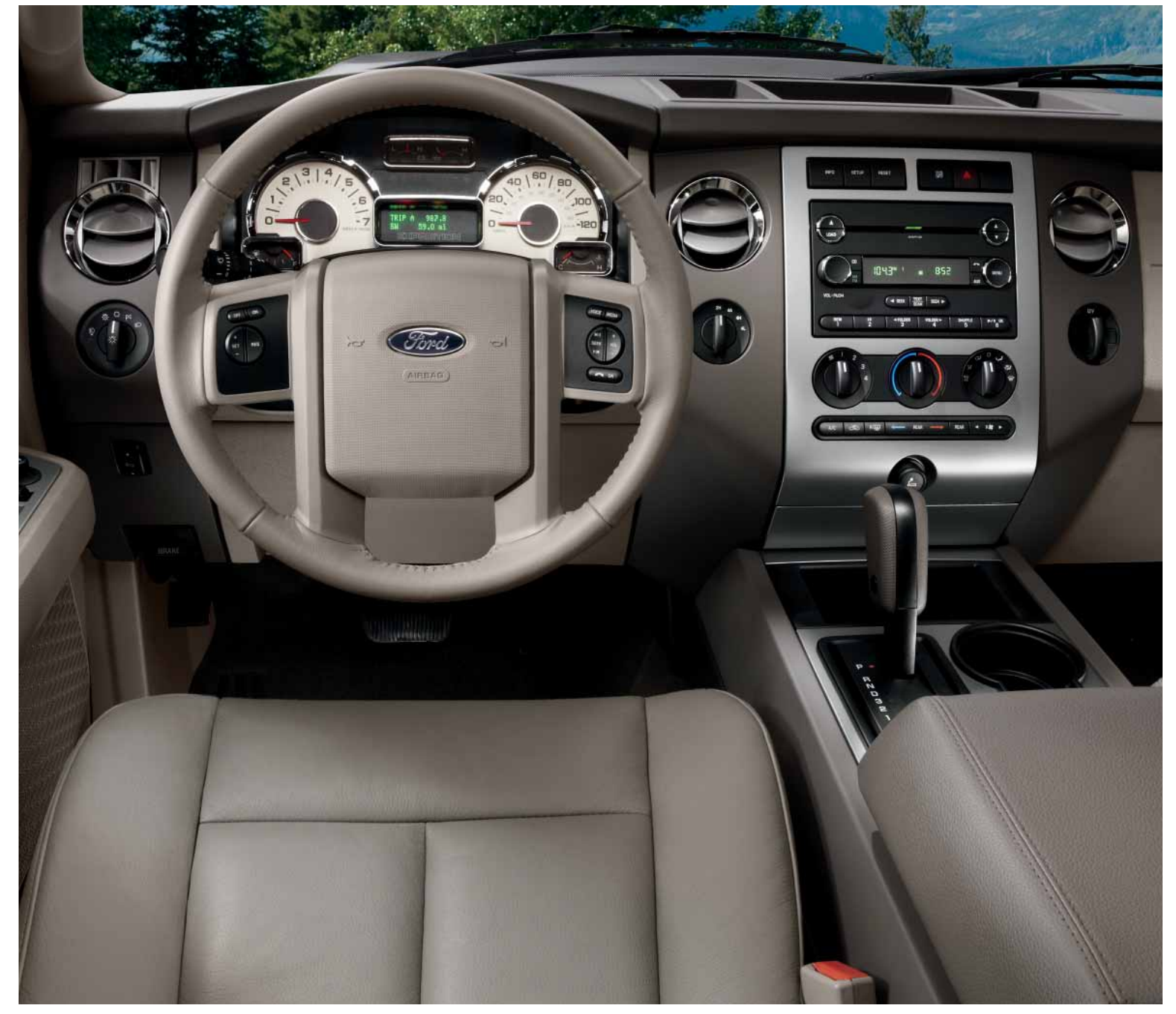
XLT. Stone leather trim. Available equipment. | XLT. Power rear-quarter windows. | All-weather floor mats in 1st and 2nd rows! | XLT. Ford SYNC. | XLT. Power-adjustable pedals.