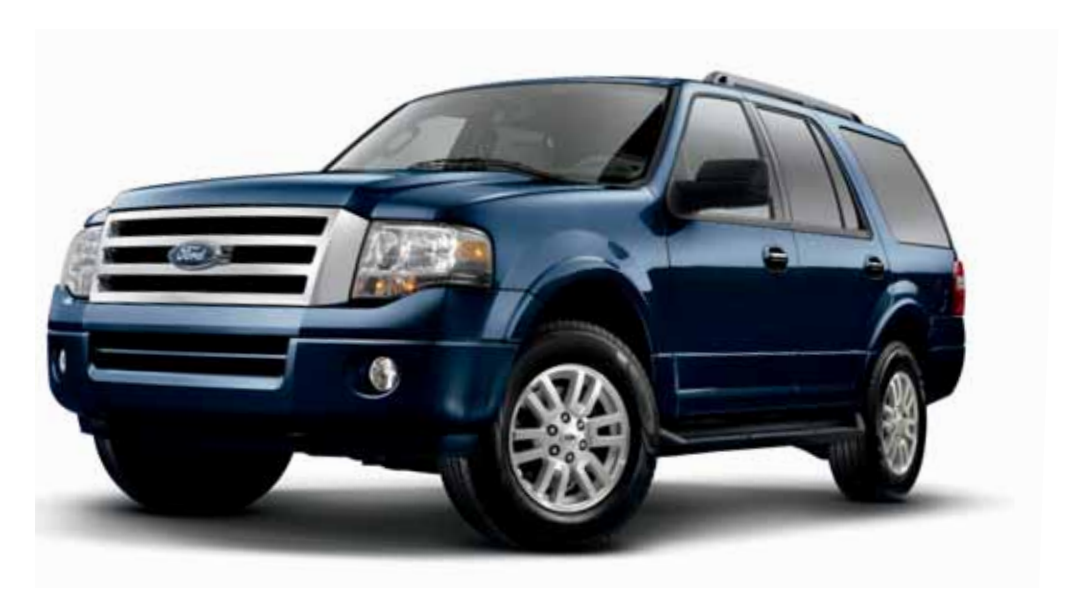
XLT. Dark Blue Pearl Metallic. Available equipment.