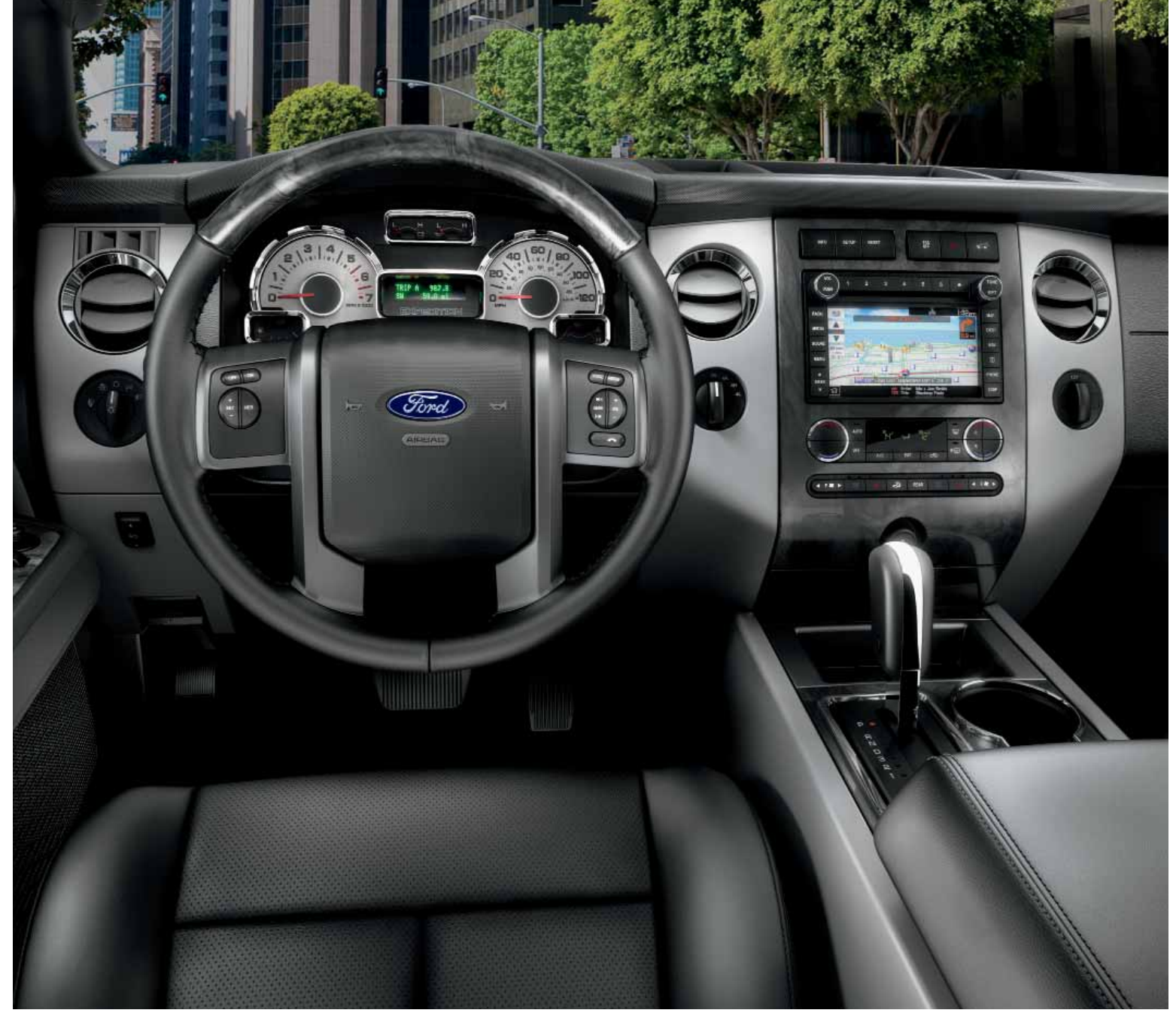
Charcoal Black leather trim with perforated inserts. Available equipment. | Heated 2nd-row seats. | 10-way power-adjustable, heated and cooled 1st-row bucket seats. | 2nd-row bucket seats! | Dual head restraint DVD by INVISION. | 1.2