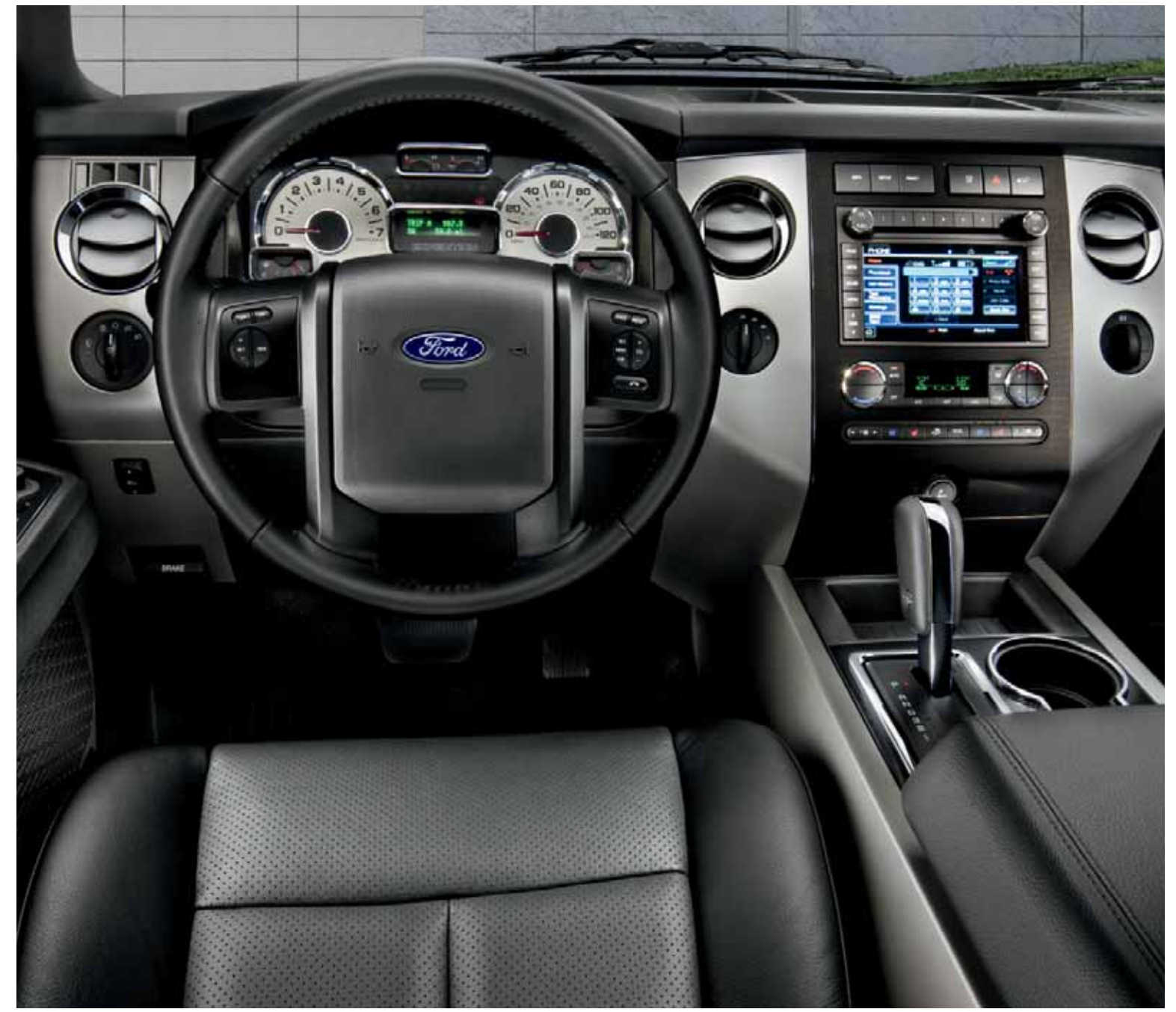
Charcoal Black leather trim. Silver Smoke perforated inserts. Sport Appearance Package! Available equipment. | PowerFold® 3rd-row seat. | 110-volt power outlet. | Rear view camera. Navigation System!