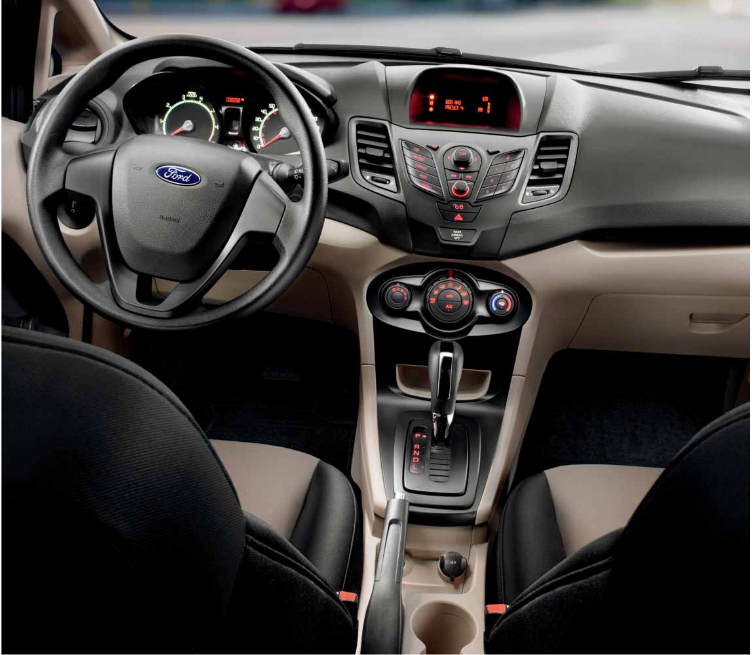
Charcoal Black cloth trim. Light Stone inserts. Available equipment. | 12.8 cu. ft. of luggage capacity. | Door map pocket with cupholder. | Power door locks switch.