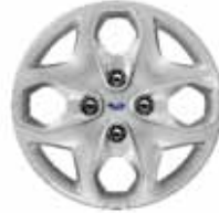
15" Steel with Covers Standard