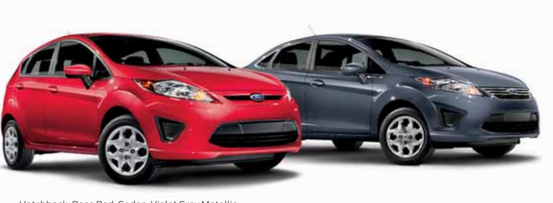
Hatchback. Race Red. Sedan. Violet Gray Metallic.