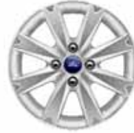
15" Painted Aluminum Included with Sport Appearance Package