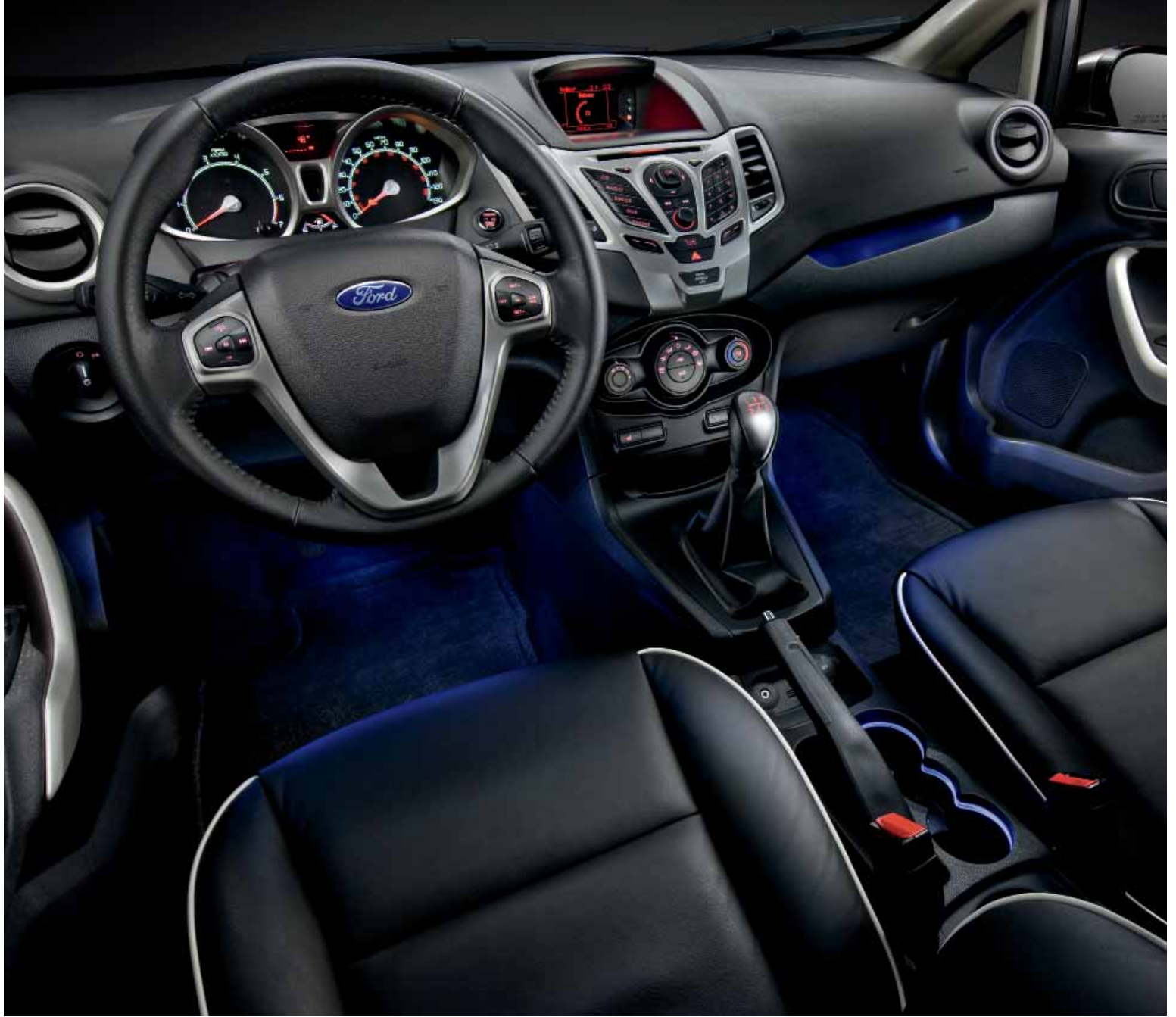
SEL. Charcoal Black leather trim. Cashmere-colored piping. Available equipment. | Red Interior Style Package 1 | White Interior Style Package 1 | Premium Sport Appearance Package spoiler 1