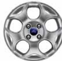
16" Polished Alloy Included with Premium Sport Appearance Package