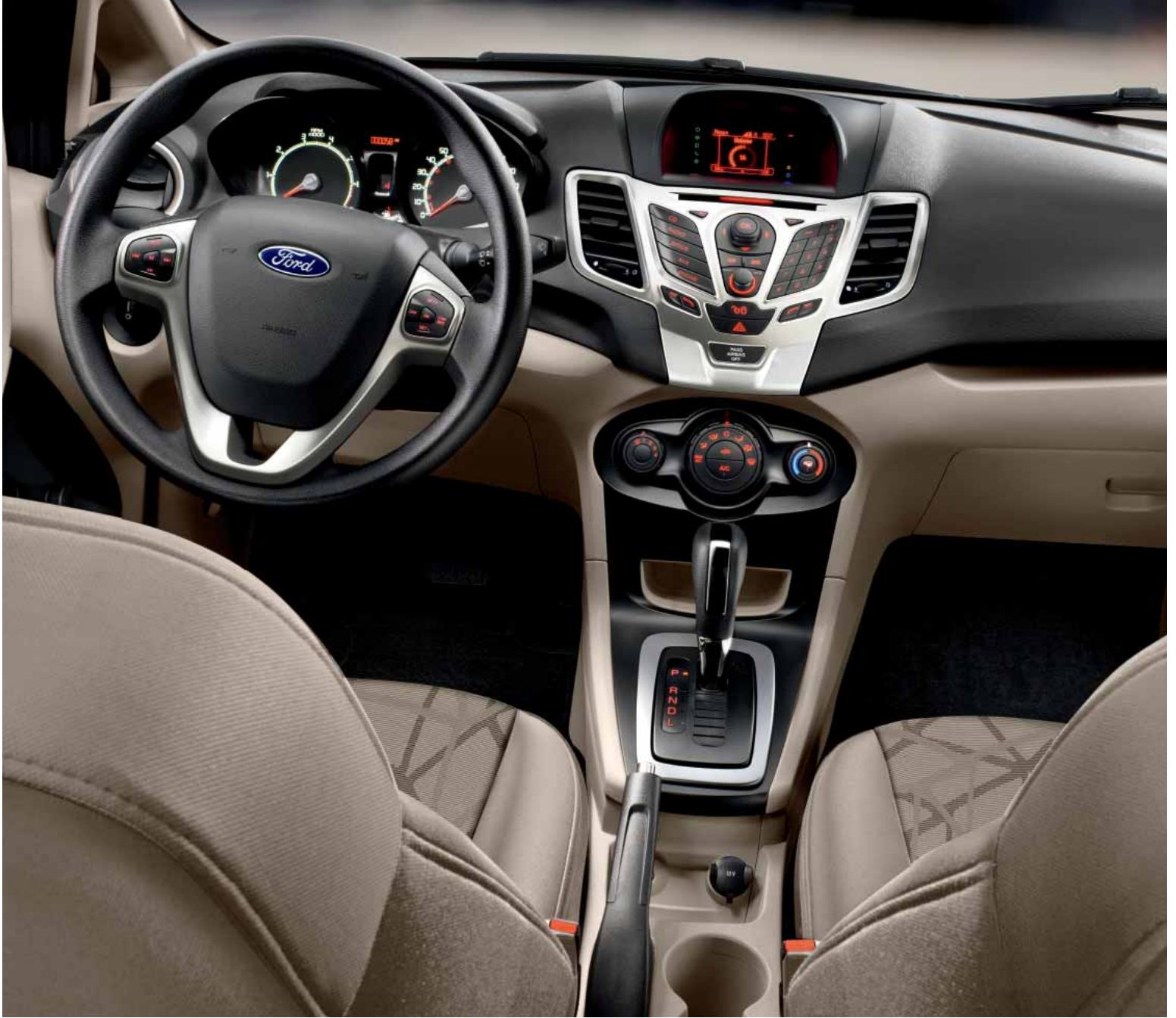
Unique Light Stone cloth trim. Available equipment. | 5-speed manual transmission shift knob. | Easy Fuel® capless fuel filler. | Hatchback luggage capacity.