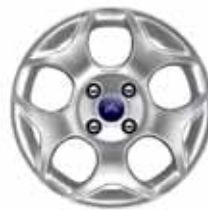
16" Premium Painted Aluminum Standard