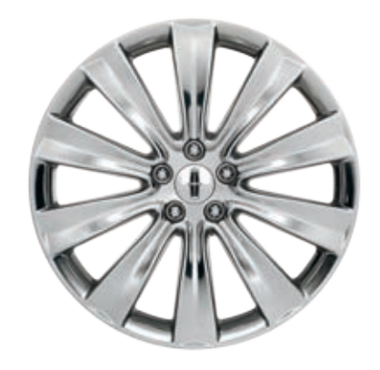
20" Polished Aluminum Standard on EcoBoost®