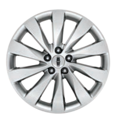
19" Premium Luster Nickel-Painted Aluminum Standard