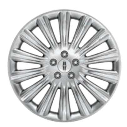
20" Premium Dark Stainless-Painted Aluminum with Chrome Inserts Available