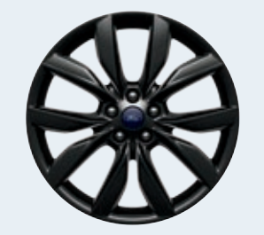
19" Ebony Black-Painted Aluminum Included: SE Sport Appearance Package