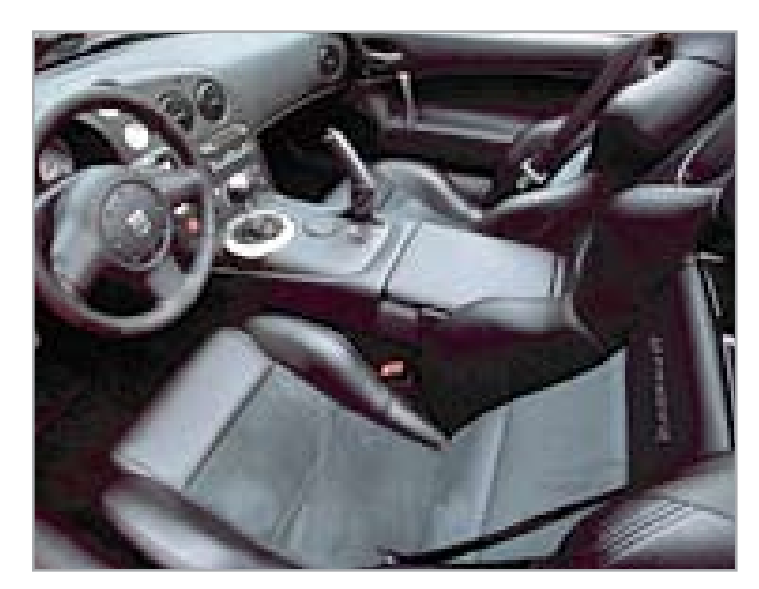
FABRIC & TRIM Aggressively bolstered leather-trimmed seating with microfiber inserts are standard.

Massive 18 x 10—inch front and 19 x 13—inch rear polished forgedaluminum wheels are standard on Viper.