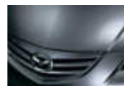
TITANIUM GRAY METALLIC MAZDA3 i 4-Door Black Cloth MAZDA3 s 4-Door/5-Door Black/Red Cloth, Black Leather