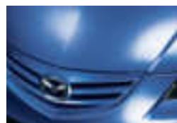
WINNING BLUE METALLIC MAZDA3 s 4-Door/5-Door Black/Blue Cloth, Black Leather