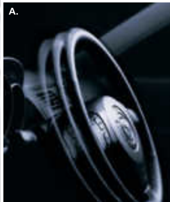
A. Every MAZDA3 features a steering wheel that tilts and telescopes. Both features help promote greater control and help ensure that you'll find a driving position that's comfortable for you.

It's easy to get excited behind the wheel of a MAZDA3s. Even before you hit the gas, you're greeted by the enticing grip of a leather-wrapped steering wheel and shifter. That just-right feeling of a driver's seat with adjustments for height and lumbar support. The pounding pulse of a 6-speaker AM/FM/CD stereo that's also SIRIUS Satellite Radio-compatible.* Fit and finish are exemplary, as is the list of other standard features. Like air conditioning with an integral pollen filter and ambient temperature display. Cruise control, power windows, mirrors and door locks. In the Grand Touring, automatic climate control is standard and a DVD-based navigation system is available. Finally, a sport compact where quality, craftsmanship and luxury can all enjoy the ride. One that so impressed automobilemag.com , they wrote: "Inside...the 3 achieves a beautiful balance of sport and elegance..."