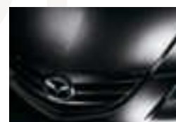
BLACK MICA MAZDA3 i 4-Door Black Cloth, Beige Cloth MAZDA3 s 4-Door/5-Door Black/Red Cloth, Black Leather