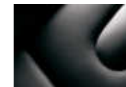
BLACK LEATHER MAZDA3 s 4-Door/5-Door