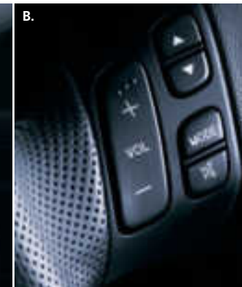
B. Steering-wheel-mounted controls for the AM/FM/CD stereo are standard on all MAZDA3 models—as are buttons for the cruise control functions on all MAZDA3 s and MAZDA3 i Touring models.