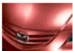
COPPER RED MICA MAZDA3 s 4-Door/5-Door Black/Red Cloth, Black Leather