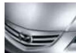
SUNLIGHT SILVER METALLIC MAZDA3 i 4-Door Black Cloth MAZDA3 s 4-Door/5-Door Black/Red Cloth, Black Leather