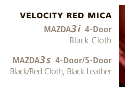
VELOCITY RED MICA MAZDA3 i 4-Door Black Cloth MAZDA3 s 4-Door/5-Door Black/Red Cloth, Black Leather