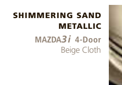
SHIMMERING SAND METALLIC MAZDA3 i 4-Door Beige Cloth