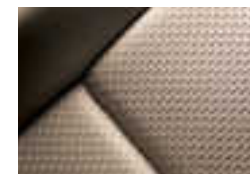
BEIGE CLOTH MAZDA3 i 4-Door