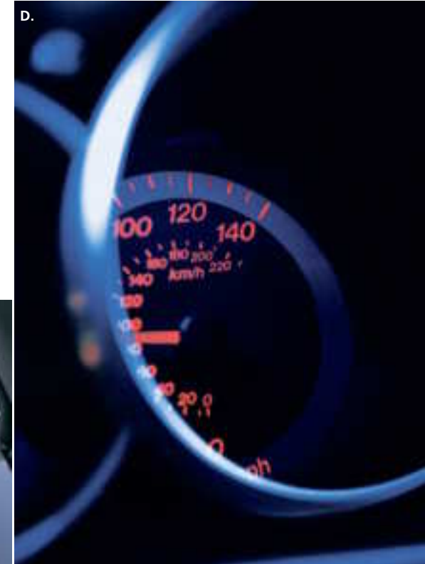
C. You can add "one-touch" power sliding-glass moonroof, with integral sunscreen, to any MAZDA3 model except the MAZDA3 i 4-Door. Its dual-purpose design slides open, or tilts up, for a better view and/or ventilation. D. Electroluminescent gauges, standard on all MAZDA3s models, provide a shining example by displaying three different color combinations to indicate daytime, nighttime or vehicle entry status.

SIRIUS SATELLITE RADIO reception requires a subscription and Mazda satellite radio receiver accessory kit. Available only in the U.S., except Alaska and Hawaii.