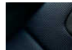
BLACK/BLUE CLOTH MAZDA3 s 4-Door/5-Door