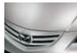
RALLY WHITE MAZDA3 i 4-Door Beige Cloth