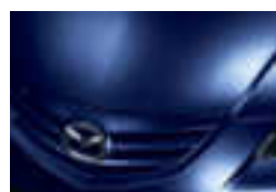
STRATO BLUE MICA MAZDA3 i 4-Door Black Cloth, Beige Cloth MAZDA3 s 4-Door/5-Door Black/Blue Cloth, Black Leather