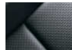
BLACK CLOTH MAZDA3 i 4-Door