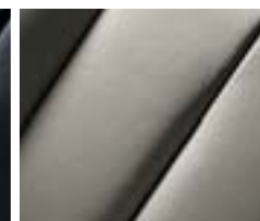
SAND LEATHER CX-7 Touring