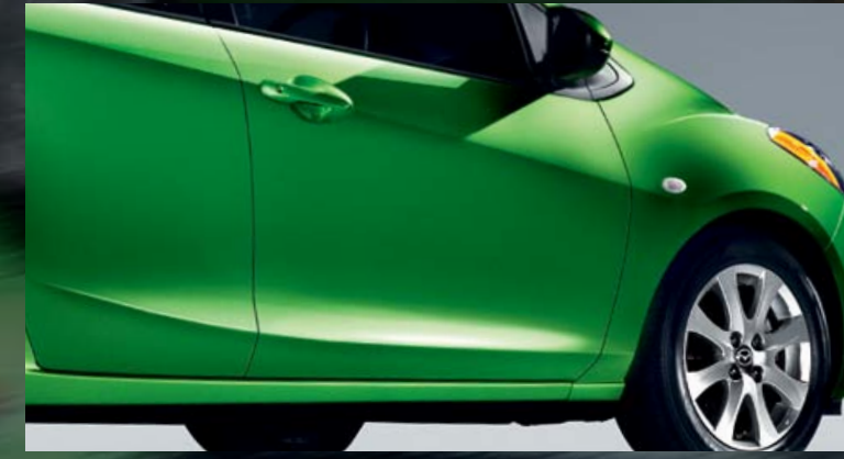
A sculpted exterior cuts down on wind resistance while catching light for an alluring look from any angle.

A sporty silhouette and convenient fifth door conceal a surprising amount of cargo space.