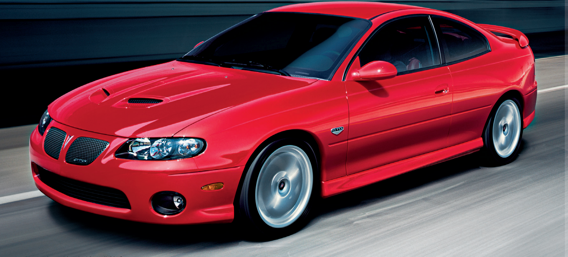
Pontiac GTO in Torrid Red with available features.