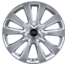
18" HYPER SILVER ALLOY WHEEL