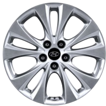
18" HYPER SILVER ALLOY WHEEL