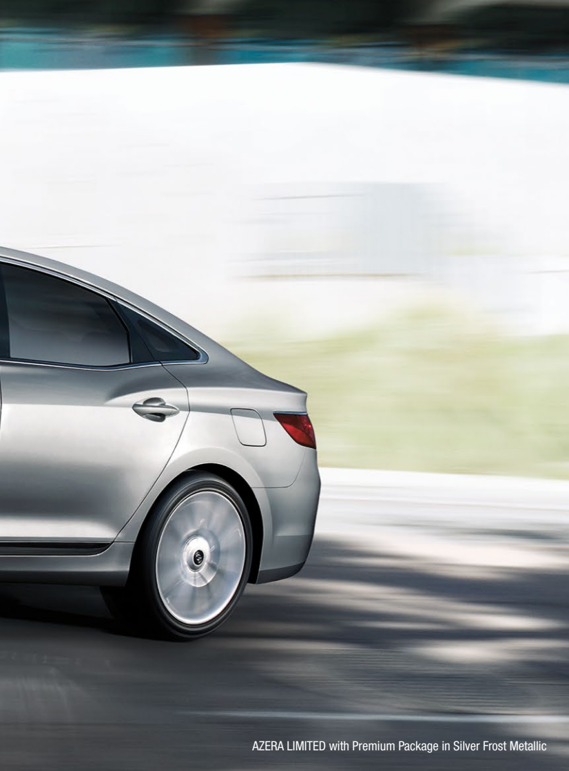
AZERA LIMITED with Premium Package in Silver Frost Metallic