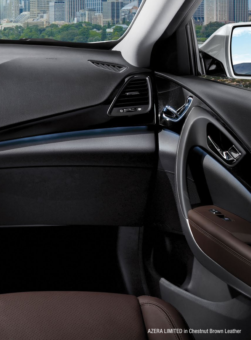
AZERA LIMITED in Chestnut Brown Leather