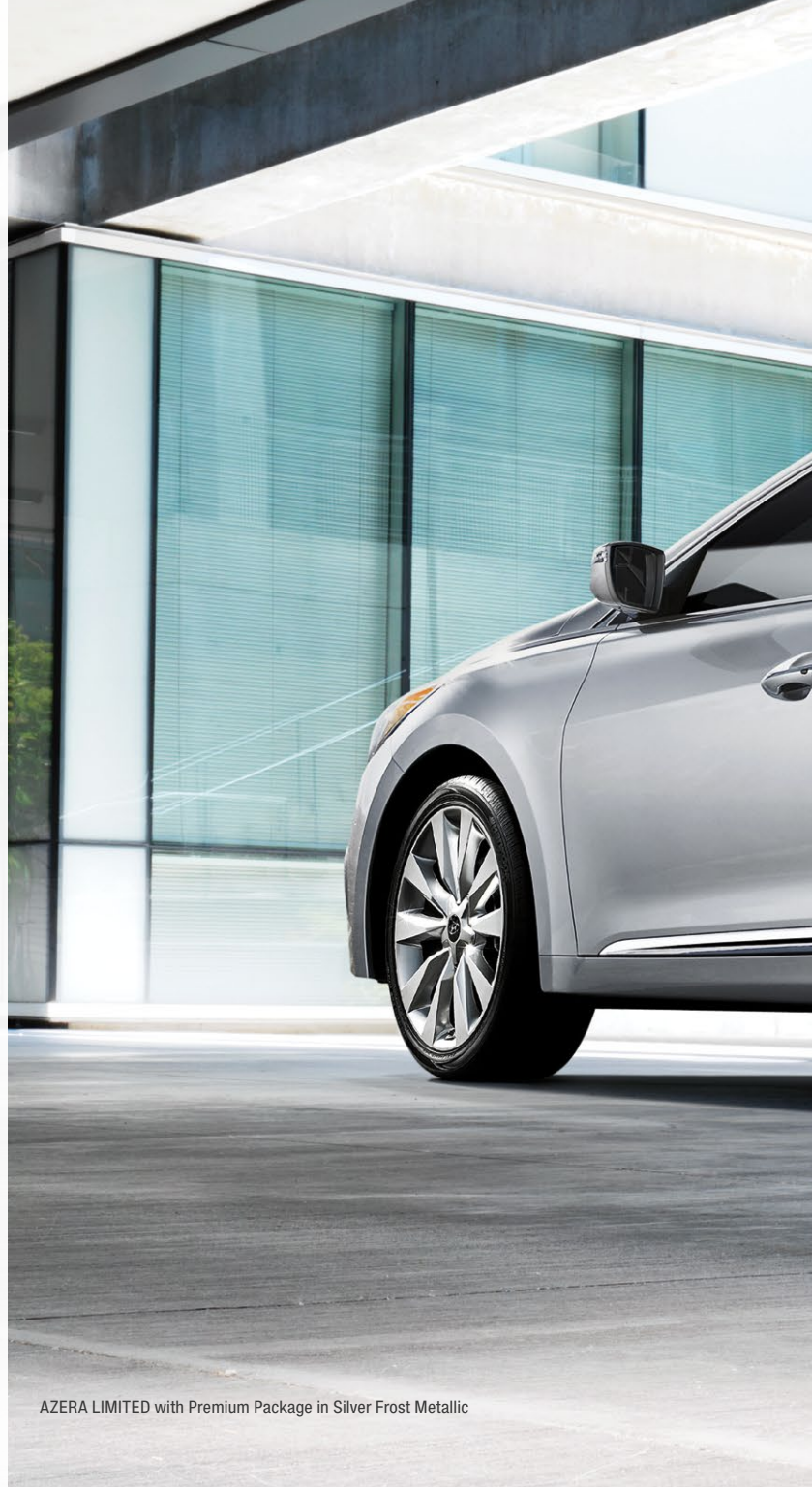
AZERA LIMITED with Premium Package in Silver Frost Metallic

The 2014 Hyundai Azera. It's one of those rare choices in life that doesn't require a compromise.