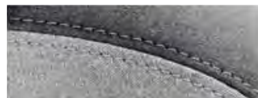
SOUL EV GRAY CLOTH WITH GRAY STITCHING (SHADOW BLACK EXTERIOR ONLY)