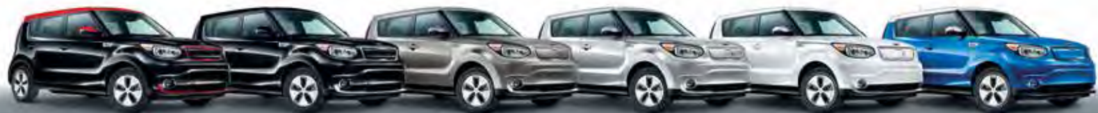
SHADOW BLACK W/INFERNO RED ROOF (EV + plus ) ONLY