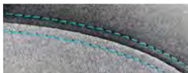
SOUL EV-e/EV GRAY CLOTH WITH BLUE STITCHING