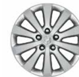
PNM 17" MULTI-SPOKE ALLOY WITH STERLING SILVER FINISH