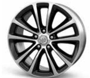
Q6X 18" ALUMINUM ALLOY WITH BLACK POCKETS; EXCLUSIVE TO SPORT TOURING