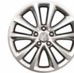
RV3 18" MULTI-SPOKE MACHINED ALLOY WITH STERLING SILVER FINISHED POCKETS