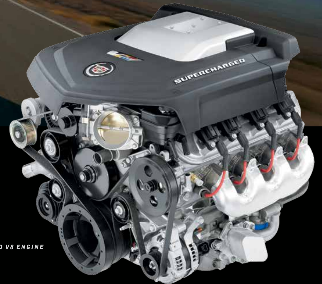
6.2L SUPERCHARGED V8 ENGINE

It will leave you questioning the laws of physics. A 6.2L supercharged V8 engine with 556 HP and 551 lb.-ft. of torque propels the V-Series from 0–60 in as fast as 3.9 seconds. Its cutting-edge supercharger incorporates a twin 4-lobe rotor design that ensures a quiet operation while also optimizing performance. Additional engineering highlights include high-strength aluminum pistons with oil-spray cooling to elevate refinement and durability and a center-feed fuel system that delivers precise fuel volume whether you're casually cruising or on the track with a wide-open throttle. Its sheer power, quite simply, will take your breath away.