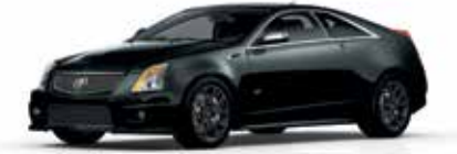
PHANTOM GRAY METALLIC