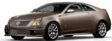
MOCHA STEEL 2