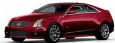
RED OBSESSION TINTCOAT 1