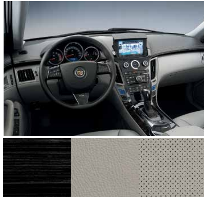
Light Titanium seats with Light Titanium sueded microfiber inserts / Midnight Sapele Wood Trim 3