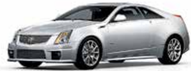
RADIANT SILVER METALLIC

A meticulous 3-layer process that results in a dramatic hue-shifting color.