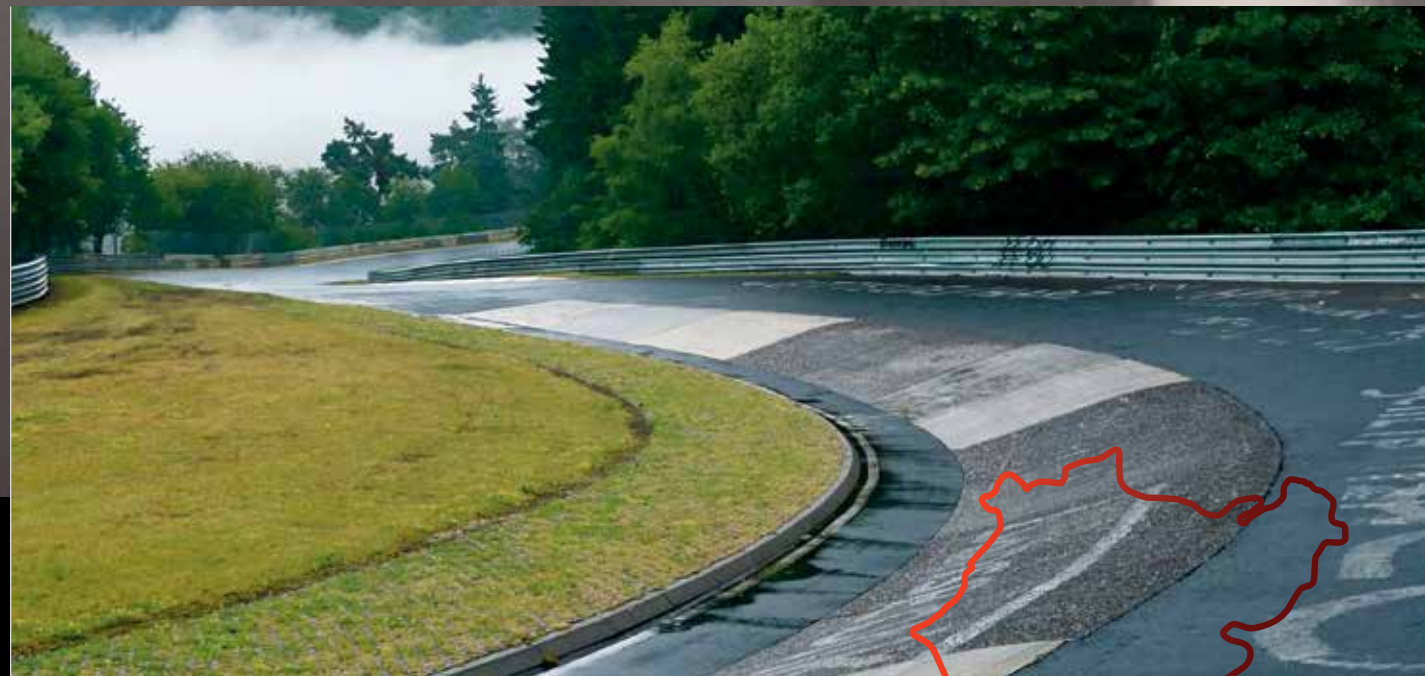
NÜRBURGRING'S FAMED KARUSSELL CORNER