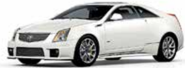
WHITE DIAMOND TRICOAT 1