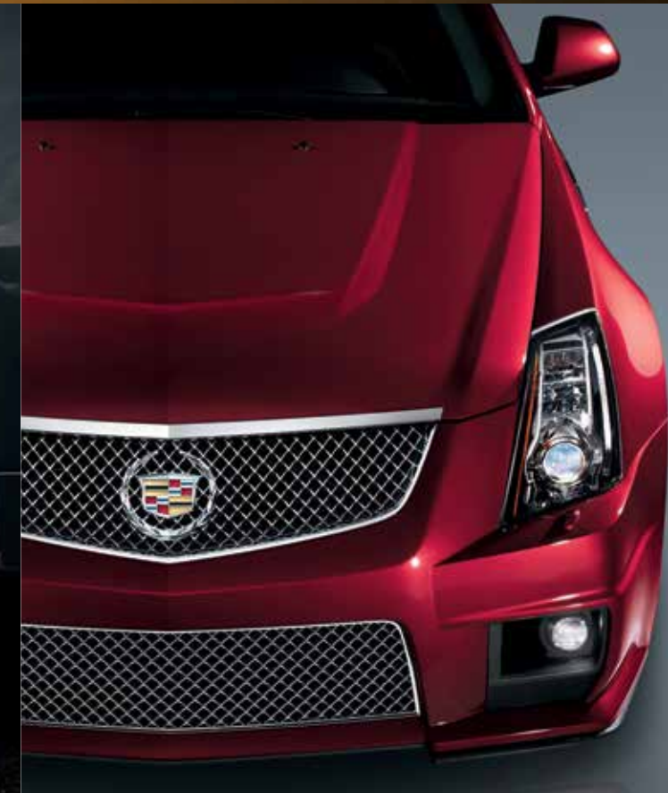
CTS-V POWER DOME HOOD

Stimulation this extraordinary should be shared. With its audacious 556 HP supercharged V8 engine and a 3.9-second 0–60 MPH time, this is the world's fastest production sedan. Every exacting detail of the CTS-V Sedan was designed and engineered for maximum performance. Its chassis, lowered by 10 mm in front and 16 mm in the rear compared to the CTS Sport Sedan to minimize air flowing underneath, is superbly controlled by the dual-mode Magnetic Ride Control. The bold front fascia was designed with an integrated splitter to improve aerodynamics, while vented ducts force-feed plenty of cooling air to the race-bred Brembo® high-performance brakes. Even the 10-spoke 19" aluminum-alloy wheels are forged for lighter weight. It's a world-class level of performance, and with four doors and a spacious rear seat, you can share the thrill with four very fortunate friends.