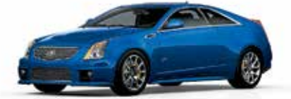
OPULENT BLUE METALLIC