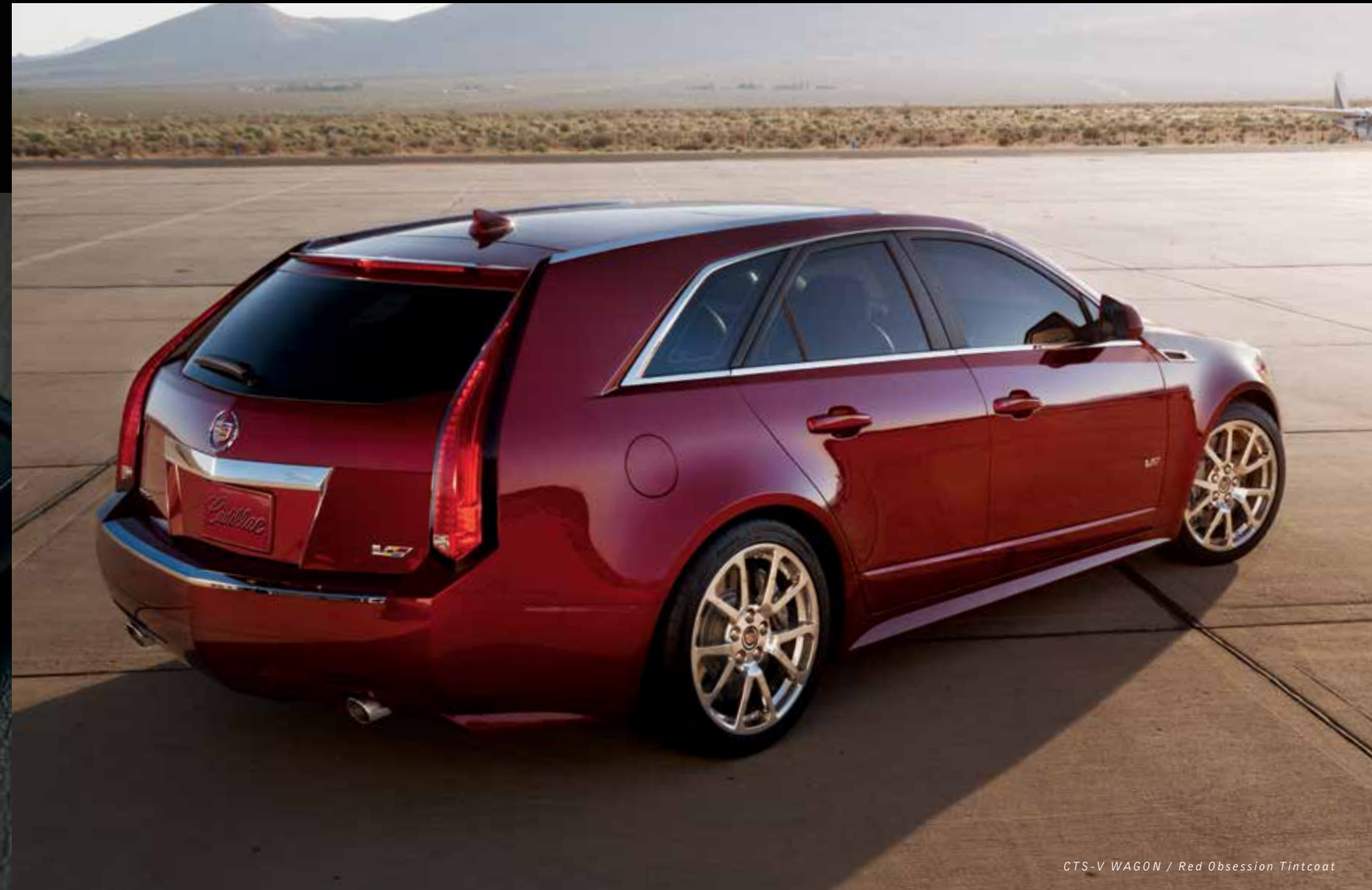
CTS-V WAGON / Red Obsession Tintcoat

By simply carrying a transmitter in your pocket or purse, Keyless Access unlocks the driver's door for you. Walk away, and it locks all the doors. With Adaptive Remote Start (automatic transmission models only), just press a button on the key fob; the ignition starts the engine and also activates the climate control system to perfectly adjust the interior temperature.