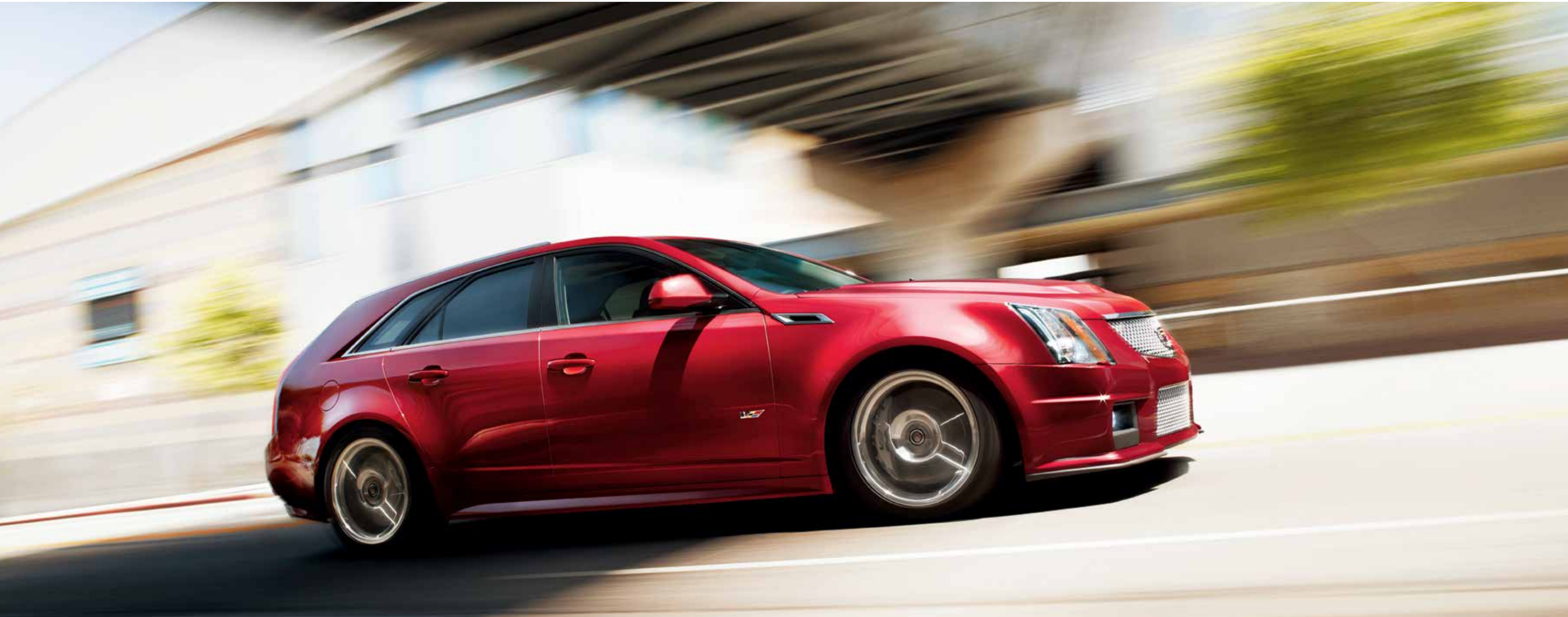
CTS-V WAGON / Red Obsession Tintcoat