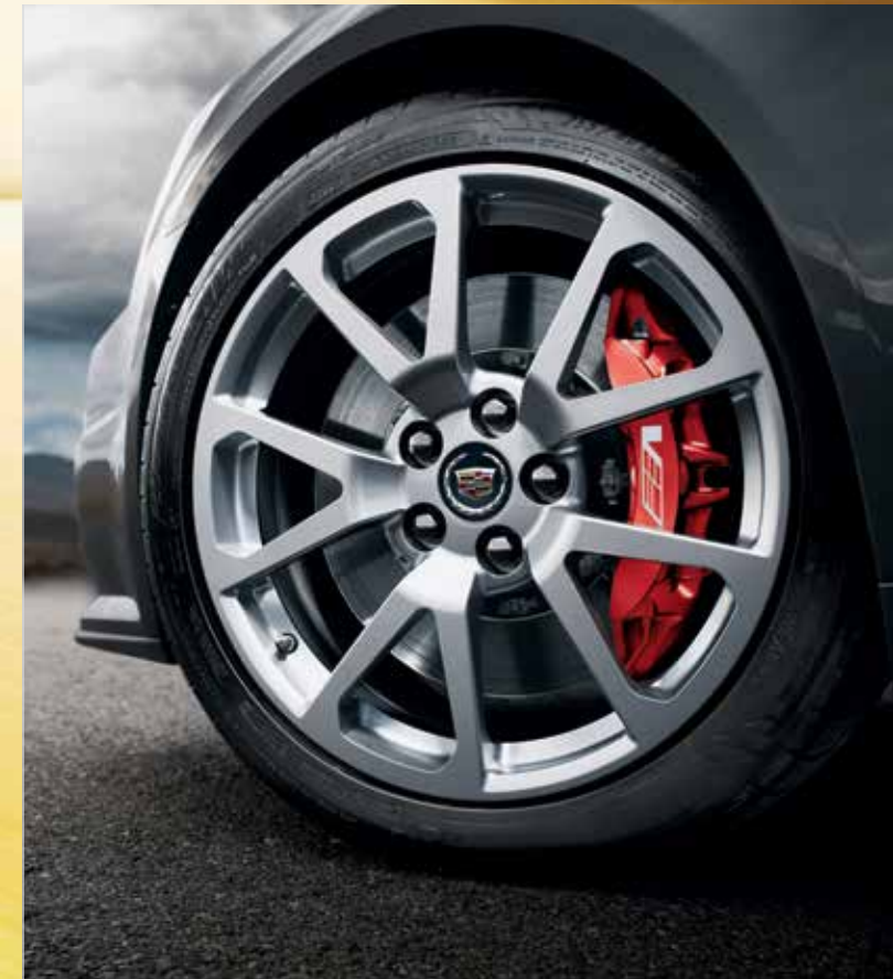
BREMBO BRAKES WITH AVAILABLE RED-PAINTED CALIPERS