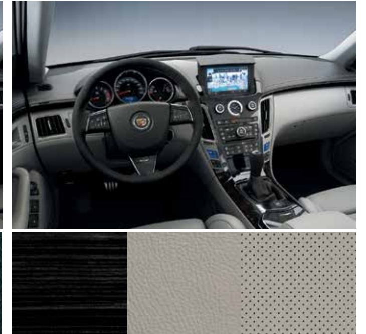
Light Titanium RECARO® performance seats with Light Titanium sueded microfiber inserts / Midnight Sapele Wood Trim 2