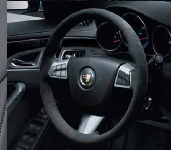
STEERING WHEEL-MOUNTED PADDLE SHIFTERS ON AUTOMATIC TRANSMISSION MODELS

The refined performance of the CTS-V Sedan doesn't end beneath the hood. Inside, we took the same fearless approach to design and execution as we did with the advanced engineering. Available RECARO® seating provides secure back and thigh support to keep you planted during spirited driving. Red LED tracers encircle the tachometer and flash at the approach of engine redline. And the g-meter records and remembers lateral acceleration, storing your best stats for posterity—and to give you something to shoot for. Even the available Midnight Sapele wood trim has a unique purpose. With its distinct dark grain, designers deemed it a perfect match to harmonize with performance-oriented features like the sueded microfiber seat inserts and available microfiber accents on the thick-rimmed steering wheel and shift knob. Adding the perfect finishing detail is the touch-screen navigation, 1 incorporating an ingenious glide-up screen.