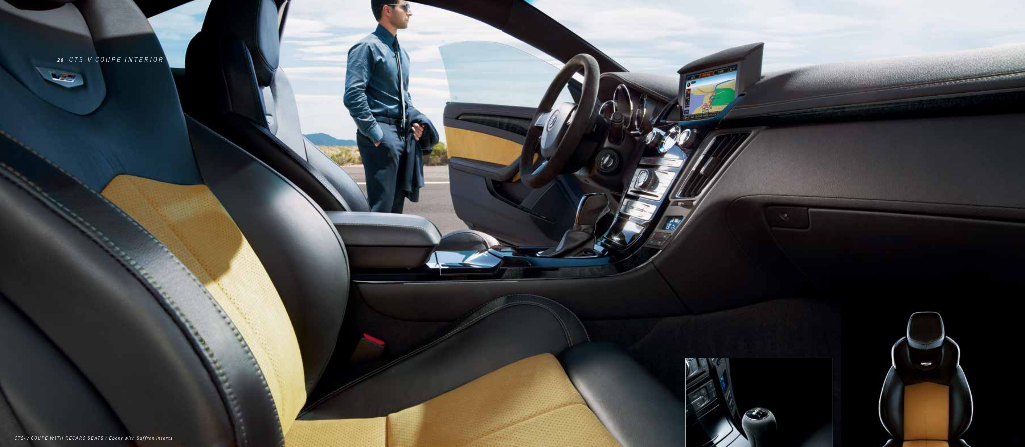
CTS-V COUPE WITH RECARO SEATS / Ebony with Saffron inserts