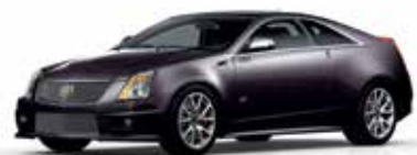
MAJESTIC PLUM METALLIC 1,3