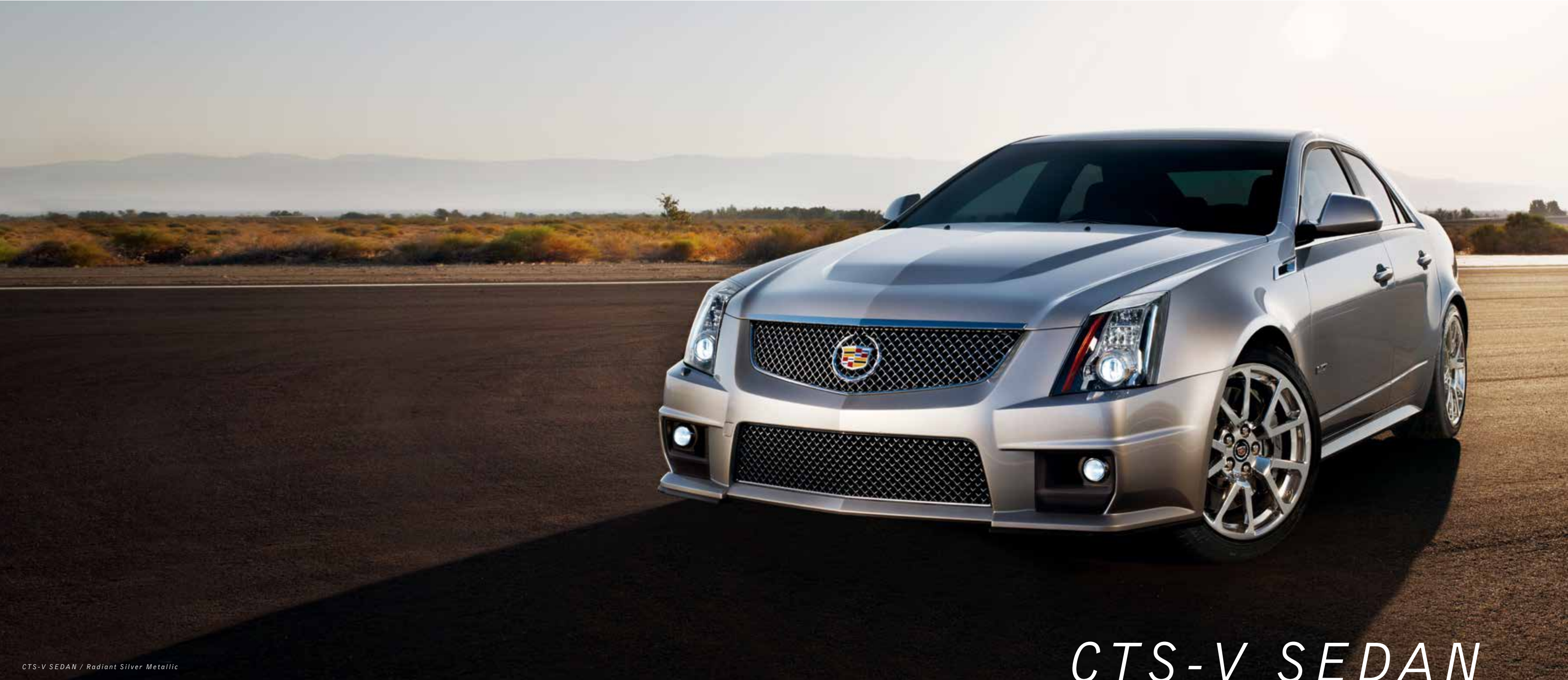
CTS-V SEDAN / Radiant Silver Metallic