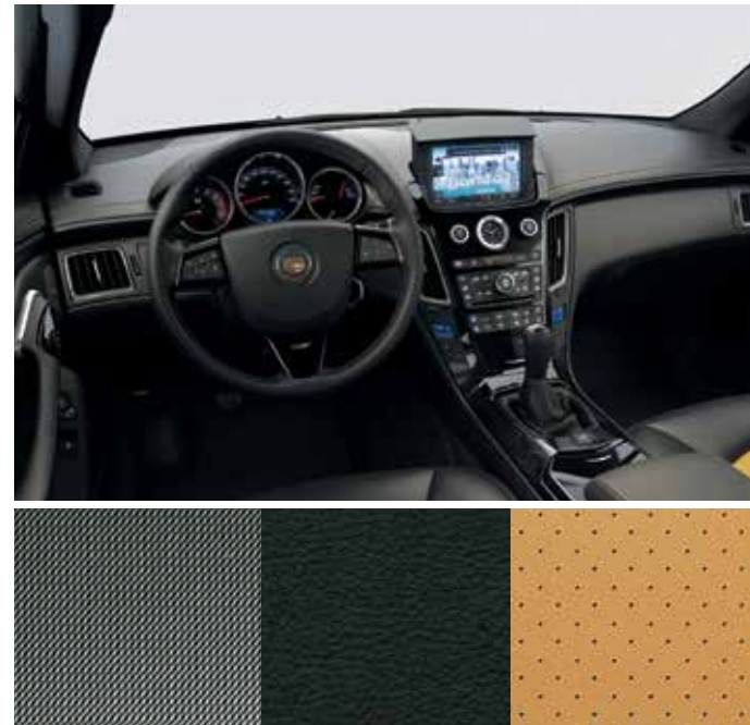
Ebony seats with Saffron sueded microfiber inserts 3,4