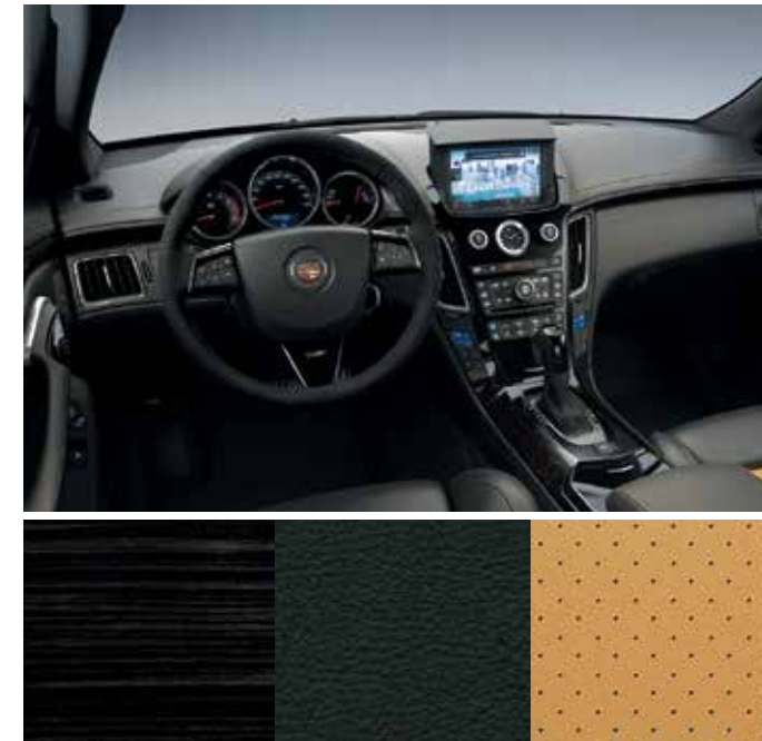
Ebony RECARO® performance seats with Saffron sueded microfiber inserts 4 / Midnight Sapele Wood Trim