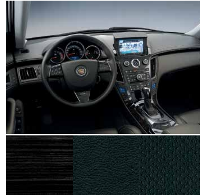
Ebony RECARO® performance seats with Ebony sueded microfiber inserts / Midnight Sapele Wood Trim 2