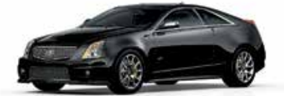
BLACK DIAMOND TRICOAT 1