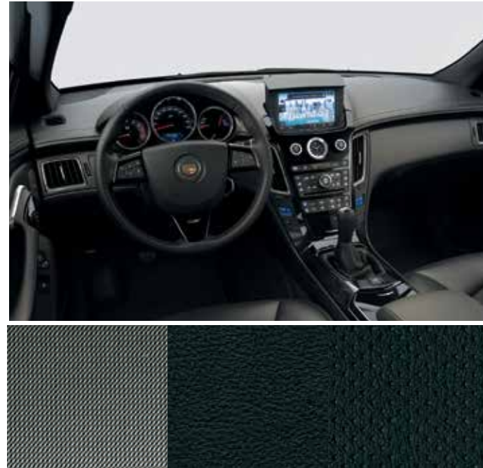
Ebony seats with Ebony sueded microfiber inserts 1