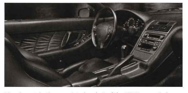
The elegant, leather-appointed cockpit of the NSX is regarded as one of the most ergonomically correct of any exotic sports car.

Additional Exterior Colors: Grand Prix White, Kaiser Silver Metallic, Spa Yellow Pearl, Monte Carlo Blue Pearl and Berlina Black