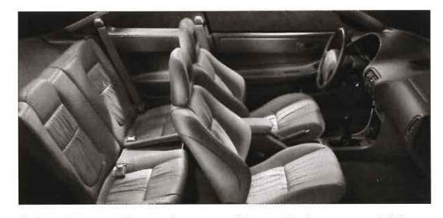
Selected Integra Sports Coupes and Sports Sedans are available with an interior appointed in supple, hand-selected leather.

*Integra Type-R available in spring 1998. †Not available on RS.