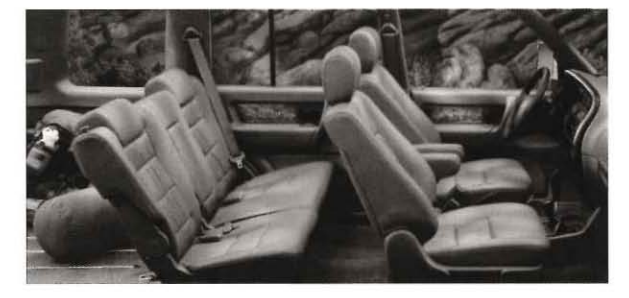
The roomy, leather-appointed interior of the Acura SLX would not look out of place in a world-class luxury sedan.

Additional Exterior Colors: Cream White, Light Silver Metallic, Ebony Black and Baltic Blue