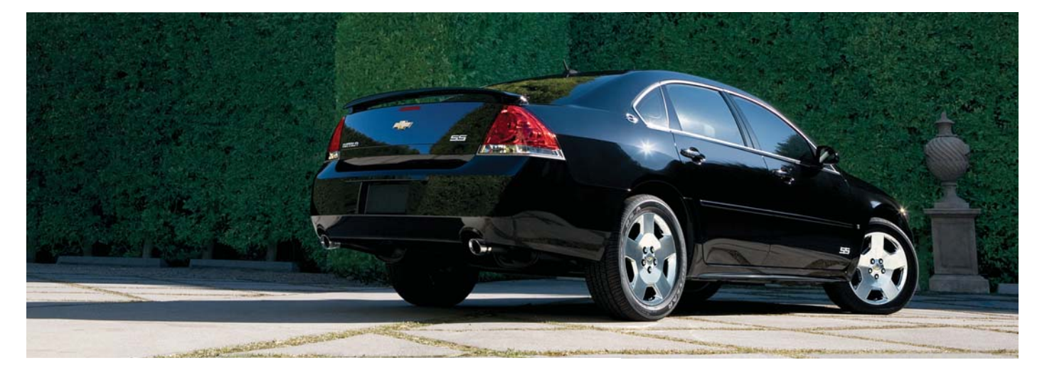
Impala SS in Black shown with available features.

1 Call 1-888-40NSTAR (1-888-466-7827) or visit onstar.com for details and system limitations. 2 Government star ratings are part of the National Highway Traffic Safety Administration's (NHTSA's) New Car Assessment Program (www.safercar.gov). 3 Whichever comes first. See dealer for details.