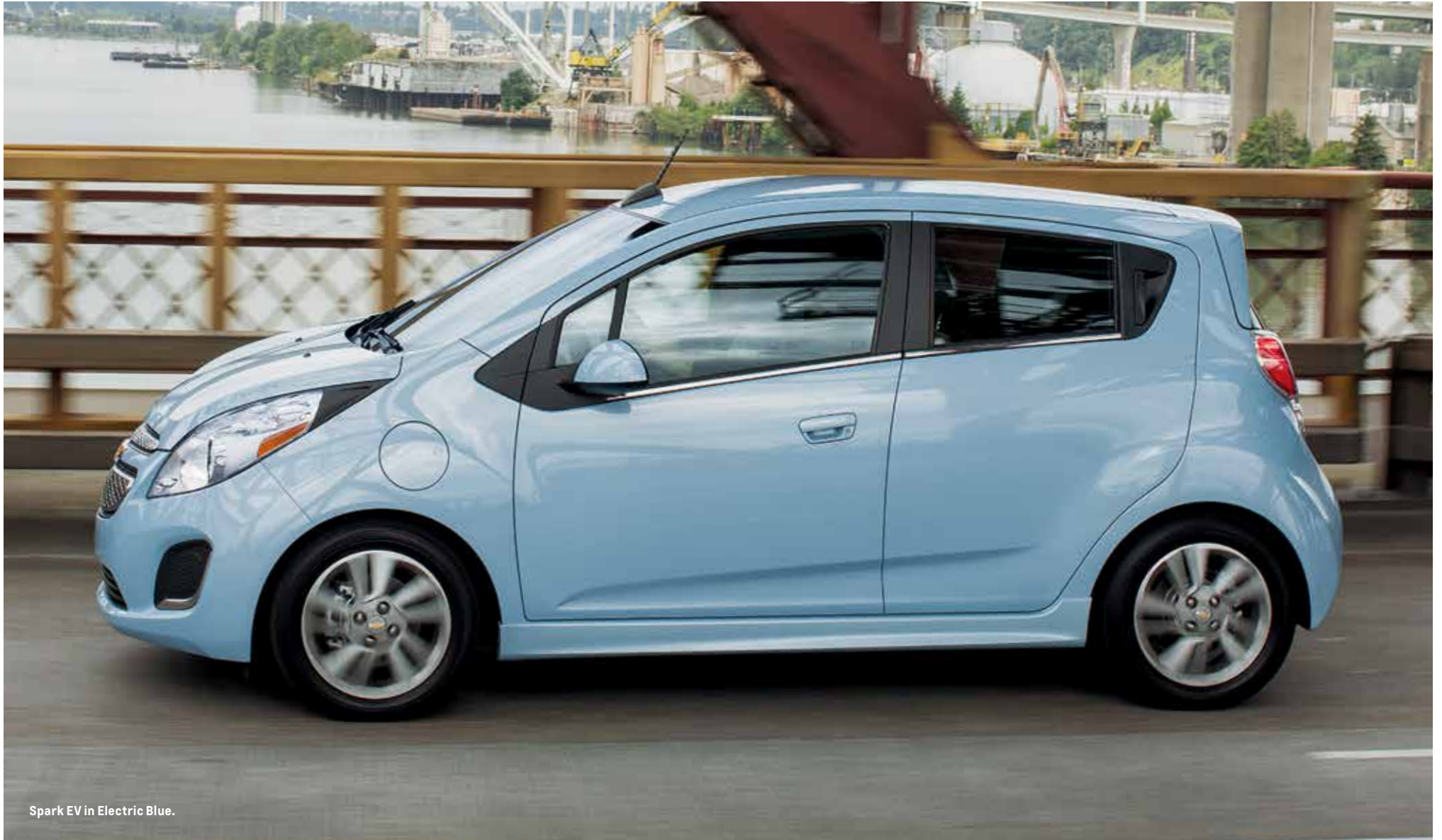
Spark EV in Electric Blue.

“QUITE POSSIBLY THE BEST ALL-ELECTRIC SMALL CAR ON THE MARKET.”