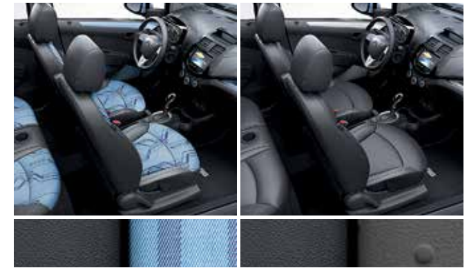
Electric Blue Cloth with Electric Blue Trim (1LT)