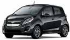
BLACK GRANITE 1