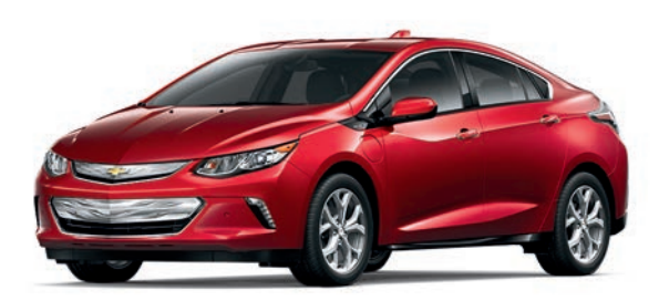
CAJUN RED TINTCOAT<sup>1,2</sup>