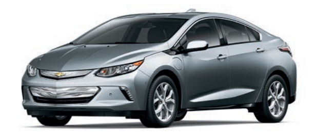
SATIN STEEL METALLIC