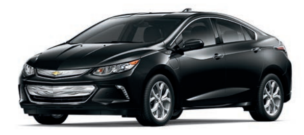
MOSAIC BLACK METALLIC