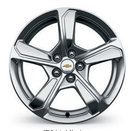
17" Painted-Aluminum (Standard on LT)