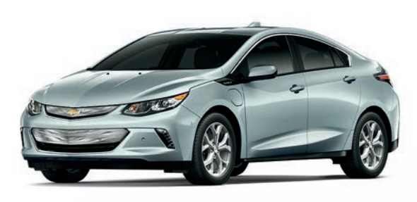
GREEN MIST METALLIC<sup>3</sup>