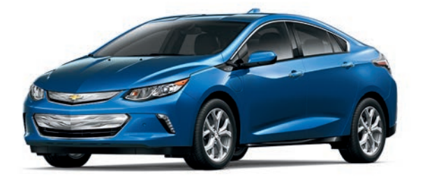
KINETIC BLUE METALLIC<sup>1, 3</sup>