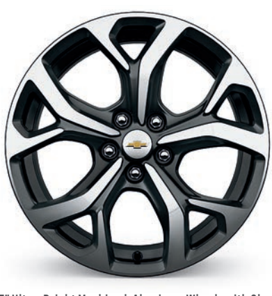
17" Ultra-Bright Machined-Aluminum Wheels with Gloss Black-Painted Pockets available from Chevrolet Accessories.