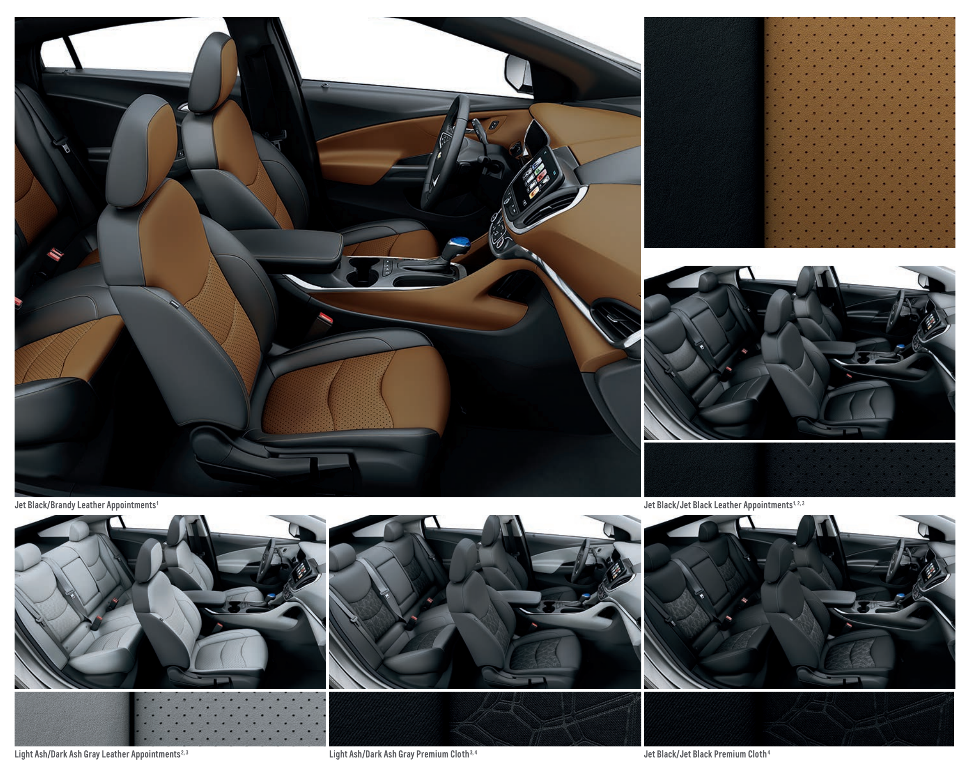
1 Standard on Premier. 2 Available on LT. 3 Requires available Comfort Package. 4 Standard on LT.