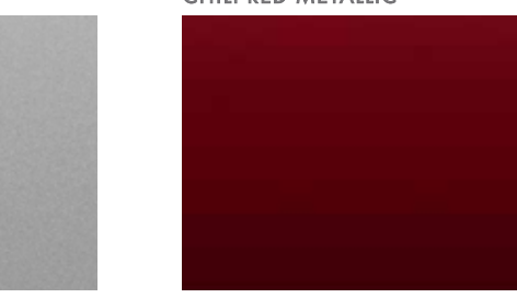
CHILI RED METALLIC<sup>2</sup>