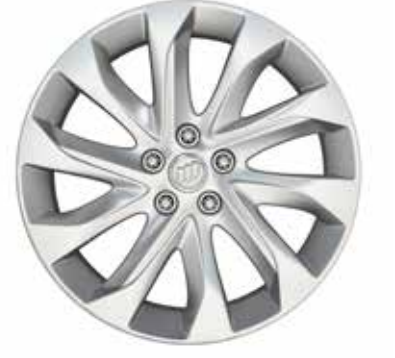
19" 10-SPOKE ALUMINUM WITH PREMIUM MANOOGIAN FINISH Standard on Premium and Premium II