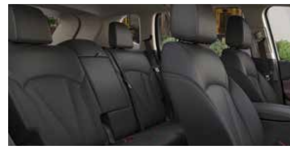
EBONY WITH DARK PLUM ACCENTS LEATHER-APPOINTED SEATING