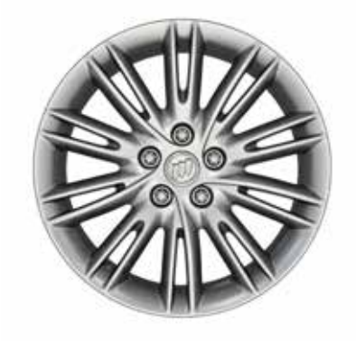
18" 10-SPOKE PAINTED ALUMINUM Standard on Envision (ISV) and Preferred