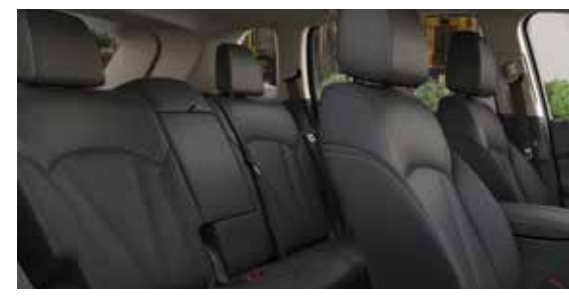
EBONY WITH EBONY ACCENTS LEATHER-APPOINTED SEATING