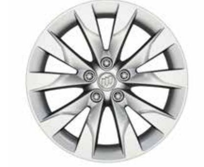
18" 10-SPOKE POLISHED ALUMINUM Standard on Essence