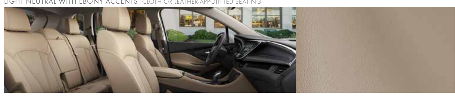
LIGHT NEUTRAL WITH EBONY ACCENTS CLOTH OR LEATHER-APPOINTED SEATING