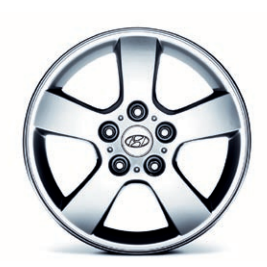
16-INCH GLS ALLOY WHEEL