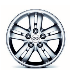
16-INCH SE/LIMITED ALLOY WHEEL