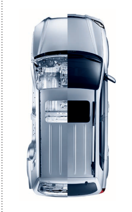
BOTH SIDES AGREE

We also believe in a warranty that lasts twice as long as the average car loan. Not to mention the average car warranty.