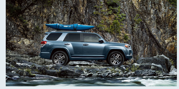
Limited 4x4 shown in Shoreline Blue Pearl [27] with available accessory roof rail cross bars.

Limited 4x4 shown in Sand Beige leather with available voice-activated touch-screen DVD navigation system. [9]