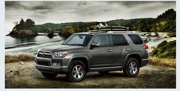
V6 SR5 4x4 shown in Magnetic Gray Metallic with available backup camera [10], Convenience Package and accessory roof rail cross bars.