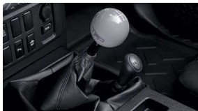
TRD Quickshifter $450 Installed MSRP*