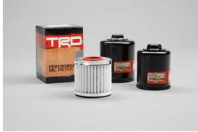
TRD Oil Filter $13 Parts Only MSRP**