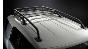
Roof Rack $649 Installed MSRP*