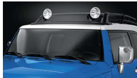
Off-Road Lights w/ Air Dam $799 Installed MSRP*