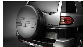
Spare Tire Cover $169 Installed MSRP*