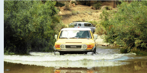
FJ Cruiser shown in Sun Fusion and Silver Fresco Metallic with accessory rock rails.