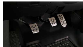
Sport Pedals $85 Installed MSRP*