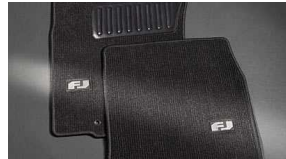
Carpet Floor Mats (4-piece set) $119 Parts Only MSRP**