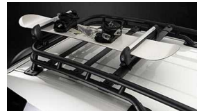
Ski/Snowboard Attachment w/ Adaptor $224 Parts Only MSRP**