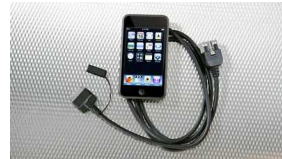
iPod Interface $299 Installed MSRP*