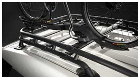
Bike Rack Attachment - w/ Adaptor $274 Parts Only MSRP**