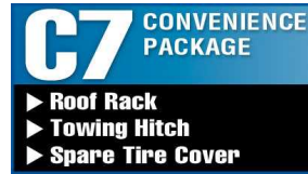
Roof Rack, Towing Hitch and Wire Harness, Spare Tire Cover $1,167 Installed MSRP*