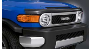
Hood Protector $155 Installed MSRP*