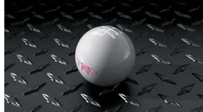
TRD Shiftknob $59 Installed MSRP*