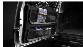
Rear Door Storage Net $89 Installed MSRP*