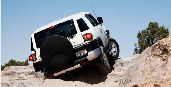
FJ Cruiser shown in Iceberg with available Upgrade Package #2. [6]