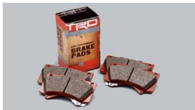
TRD Performance Brake Pads $95 Parts Only MSRP**