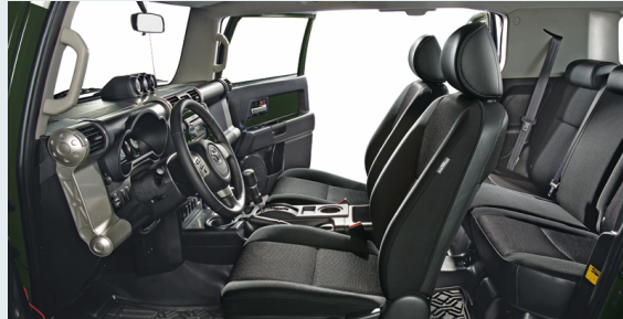
FJ Cruiser 4WD shown in Dark Charcoal with available Upgrade Package #2. 2008 model shown. [6]