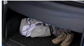
Cargo Cover $90 Installed MSRP*