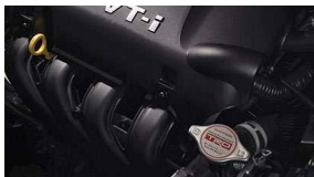
TRD Radiator Cap $37 Parts Only MSRP**