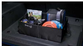
Cargo Tote $40 Parts Only MSRP**