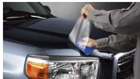
Paint Protection Film $395 Installed MSRP*