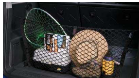
Cargo Net $49 Installed MSRP*