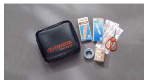
First Aid Kit $29 Installed MSRP*