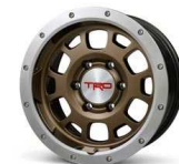
TRD 16" Off-road Beadlock Wheel $219 Parts Only MSRP**