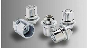
Alloy Wheel Lock Set $81 Installed MSRP*