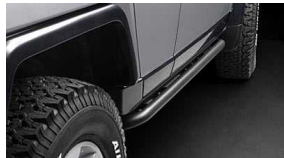
Rock Rails $575 Installed MSRP*