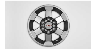
16-in. TRD 6-Spoke Alloy Wheels & LT265/75R16 BFG All-Terrain T/A KO Tires w/Wheel and Spare Tire Locks $1,899 Installed MSRP*