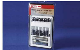
TRD Wheel Locks $150 Parts Only MSRP**