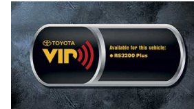
VIP Security RS3200 Plus System $479 Installed MSRP*