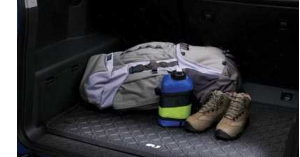
All Weather Cargo Mat $79 Parts Only MSRP**