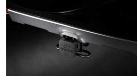
Towing Hitch & Wire Harness $349 Installed MSRP*