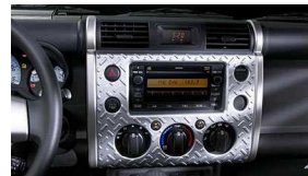
Molded Dash Applique $350 Installed MSRP*