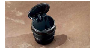
Ashtray Kit $17 Parts Only MSRP**