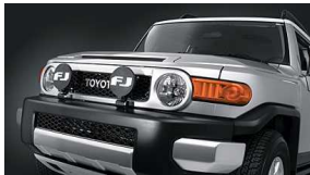
Auxiliary Driving Lights - Bumper $475 Installed MSRP*