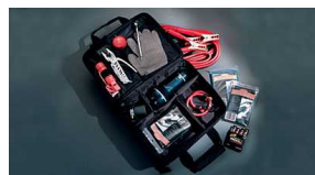
Emergency Assistance Kit $70 Installed MSRP*