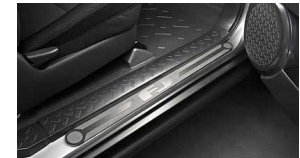
Billet Door Sills $149 Installed MSRP*