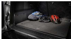
Carpet Cargo Mat $69 Parts Only MSRP**