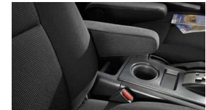
Armrest $125 Installed MSRP*