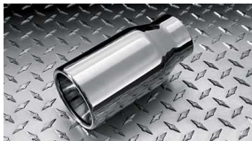
Exhaust Tip $75 Installed MSRP*