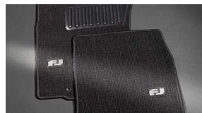
Carpet Floor Mats & Cargo Mat $199 Installed MSRP*