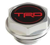
TRD Oil Cap $45 Parts Only MSRP**