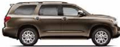
PYRITE MICA Graphite, Red Rock 1 or Sand Beige interior