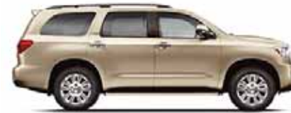
SANDY BEACH METALLIC Red Rock 1 or Sand Beige interior