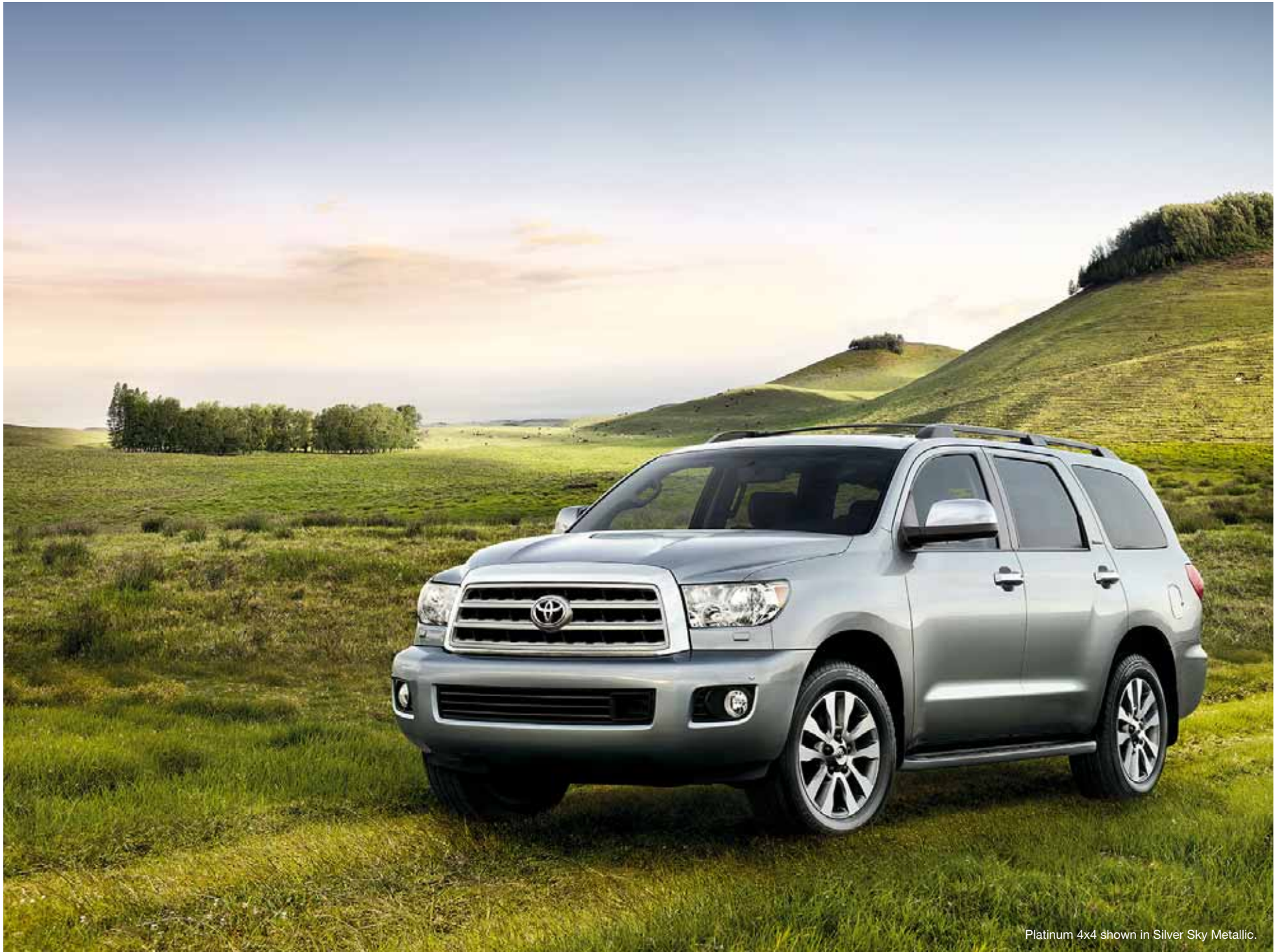
Platinum 4x4 shown in Silver Sky Metallic.