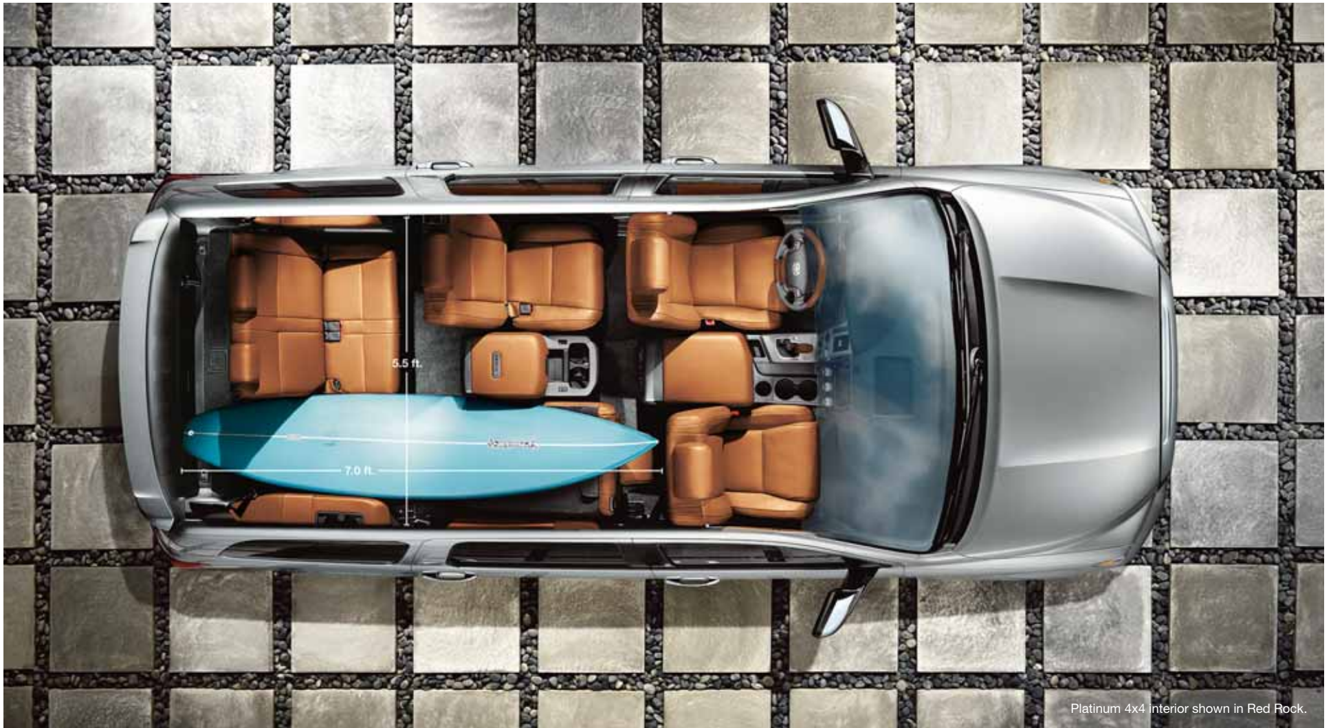
Platinum 4x4 interior shown in Red Rock.

More than you're likely to need. There's seating for eight 1 with the standard third row. Or you can fold the seats flat for 120.1 cubic feet of cargo space 2 . That's enough room for all the gear you and your crew will need to go just about anywhere. You could just say it's big — but big is too small a word to do it justice.