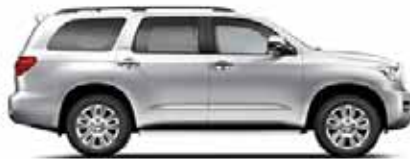
SILVER SKY METALLIC Graphite or Red Rock 1 interior