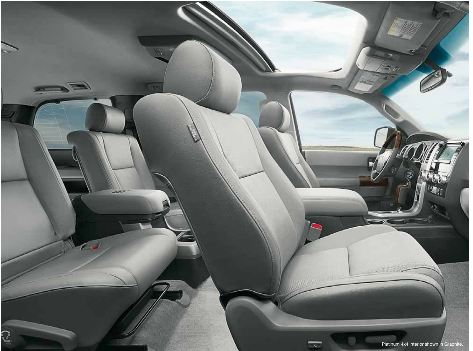
Platinum 4x4 interior shown in Graphite.