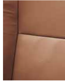
Platinum perforated leather in Red Rock