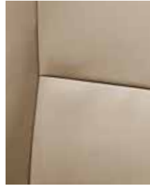
Limited leather in Sand Beige