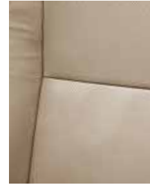
Platinum perforated leather in Sand Beige