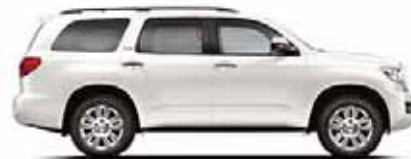
BLIZZARD PEARL 1,2 Graphite, Red Rock 1 or Sand Beige interior