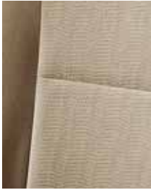
SR5 fabric in Sand Beige