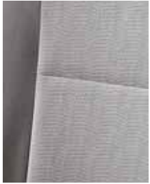
SR5 fabric in Graphite