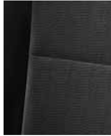
SR5 Sport fabric in Black