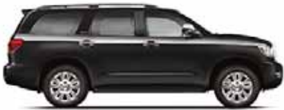
BLACK Graphite, Red Rock 1 or Sand Beige interior

Sequoia offers eight exterior colors to choose from — easy to remember since it also offers available seating for eight. And each exterior color offers two or three interior colors to match. Decisions, decisions.