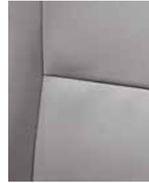
Platinum perforated leather in Graphite