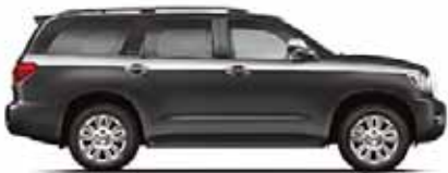
MAGNETIC GRAY METALLIC Graphite or Red Rock 1 interior