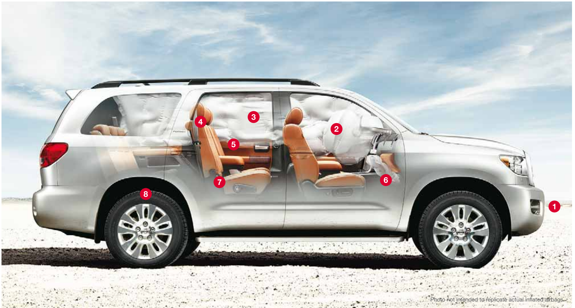
Photo not intended to replicate actual inflated airbags.

Advanced safety technologies are something you'll find throughout Sequoia. Clearly Toyota doesn't believe in simply relying on the vehicle's size to help ensure your safety. Instead, our engineers have equipped Sequoia with an array of both active and passive safety measures. Active safety features, such as Vehicle Stability Control (VSC), help you avoid trouble. Passive safety features come to your aid in the event trouble proves unavoidable. Both help you breathe easier.