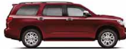
CASSIS PEARL Graphite, Red Rock 1 or Sand Beige interior