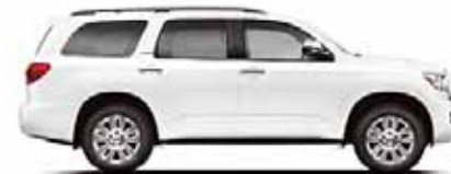
SUPER WHITE 3 Graphite or Sand Beige interior