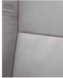
Limited leather in Graphite