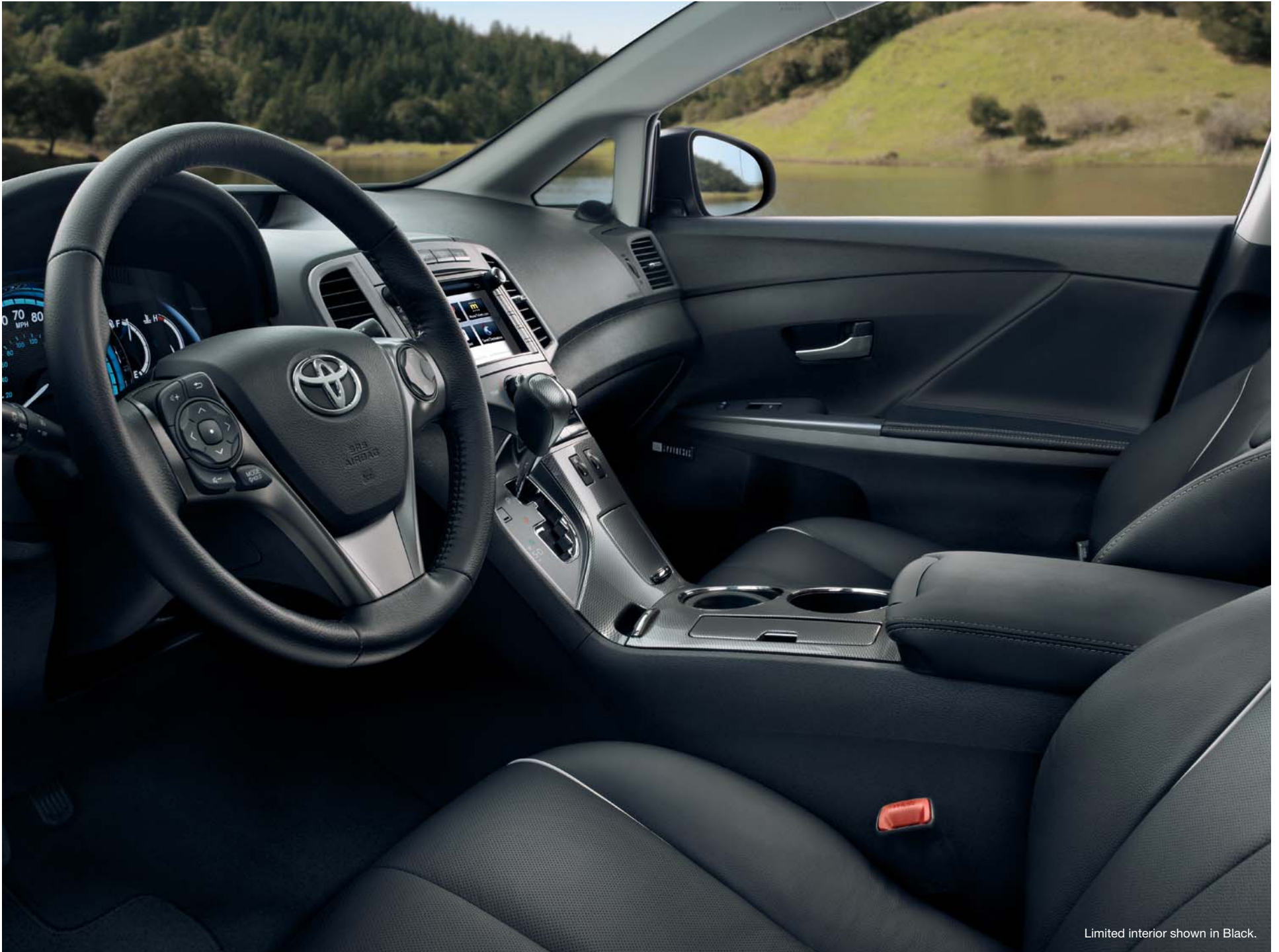
Limited interior shown in Black.