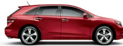
BARCELONA RED METALLIC