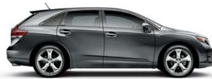
MAGNETIC GRAY METALLIC