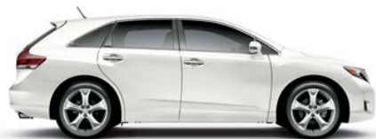
BLIZZARD PEARL 1