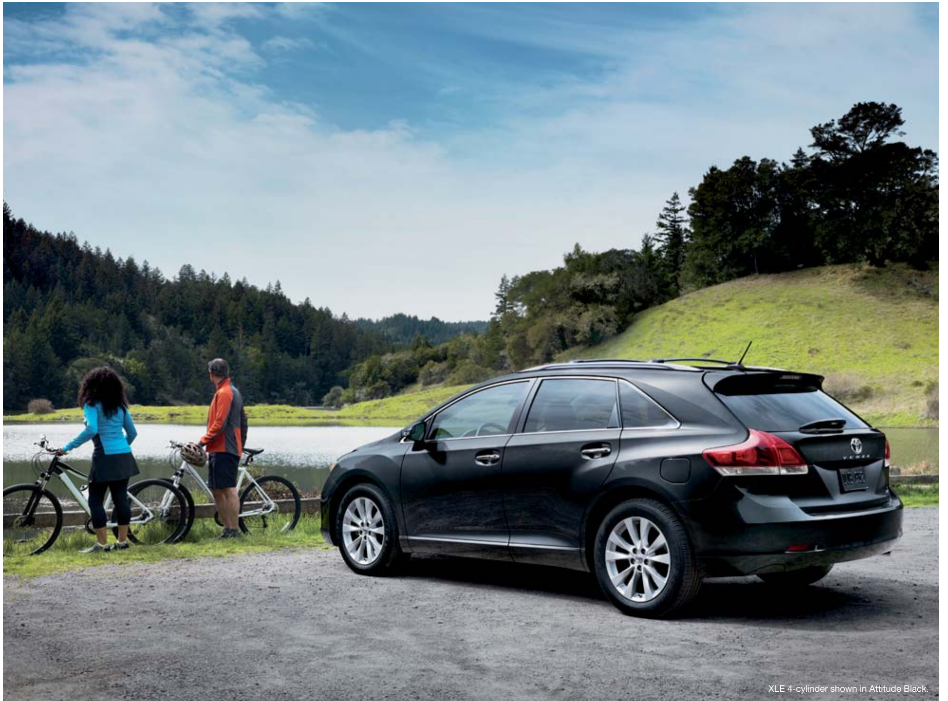
XLE 4-cylinder shown in Attitude Black.