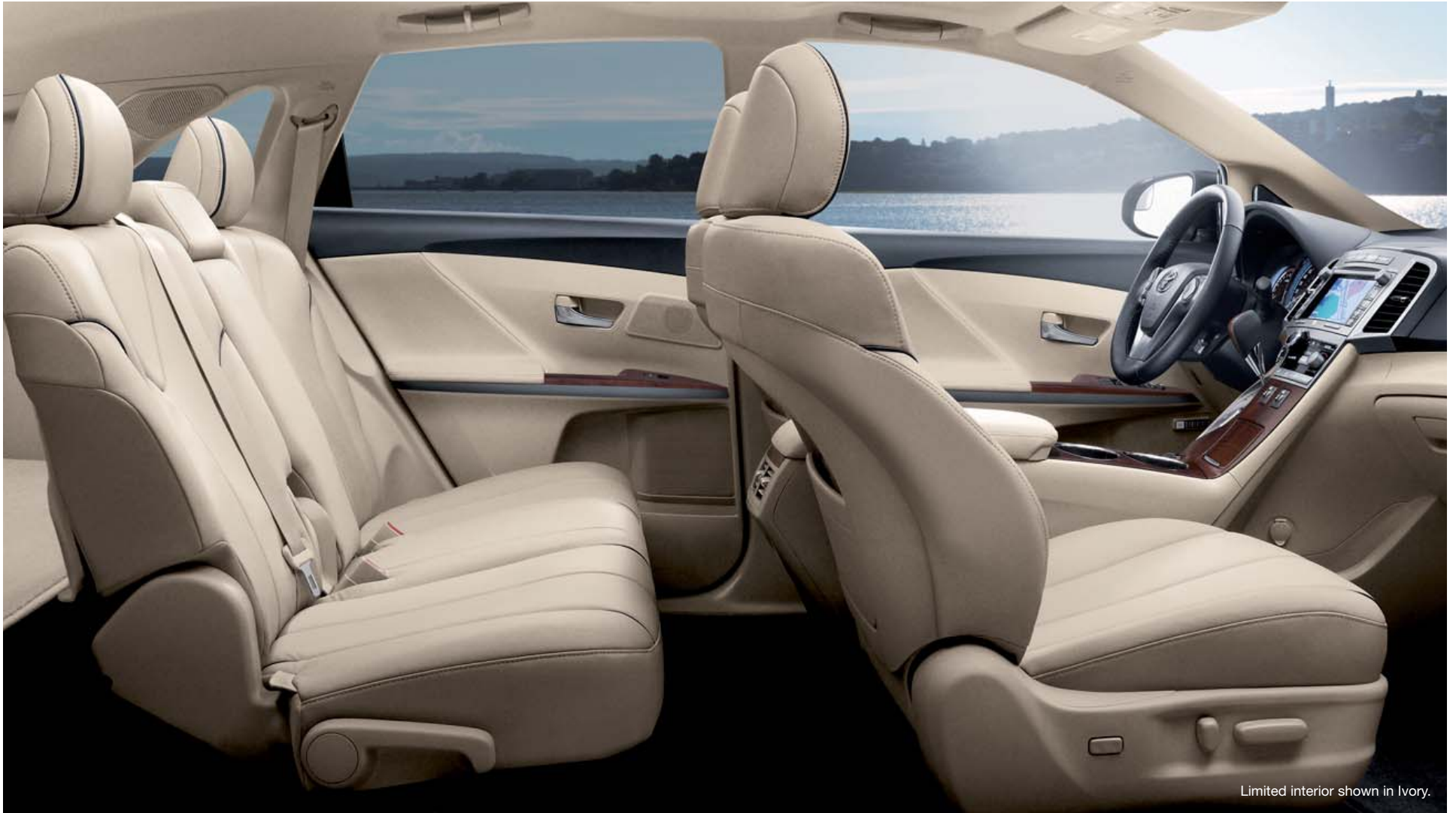
Limited interior shown in Ivory.

With its thoughtful design and attention to craftsmanship, Venza is a truly remarkable blend of comfort, style and versatility.