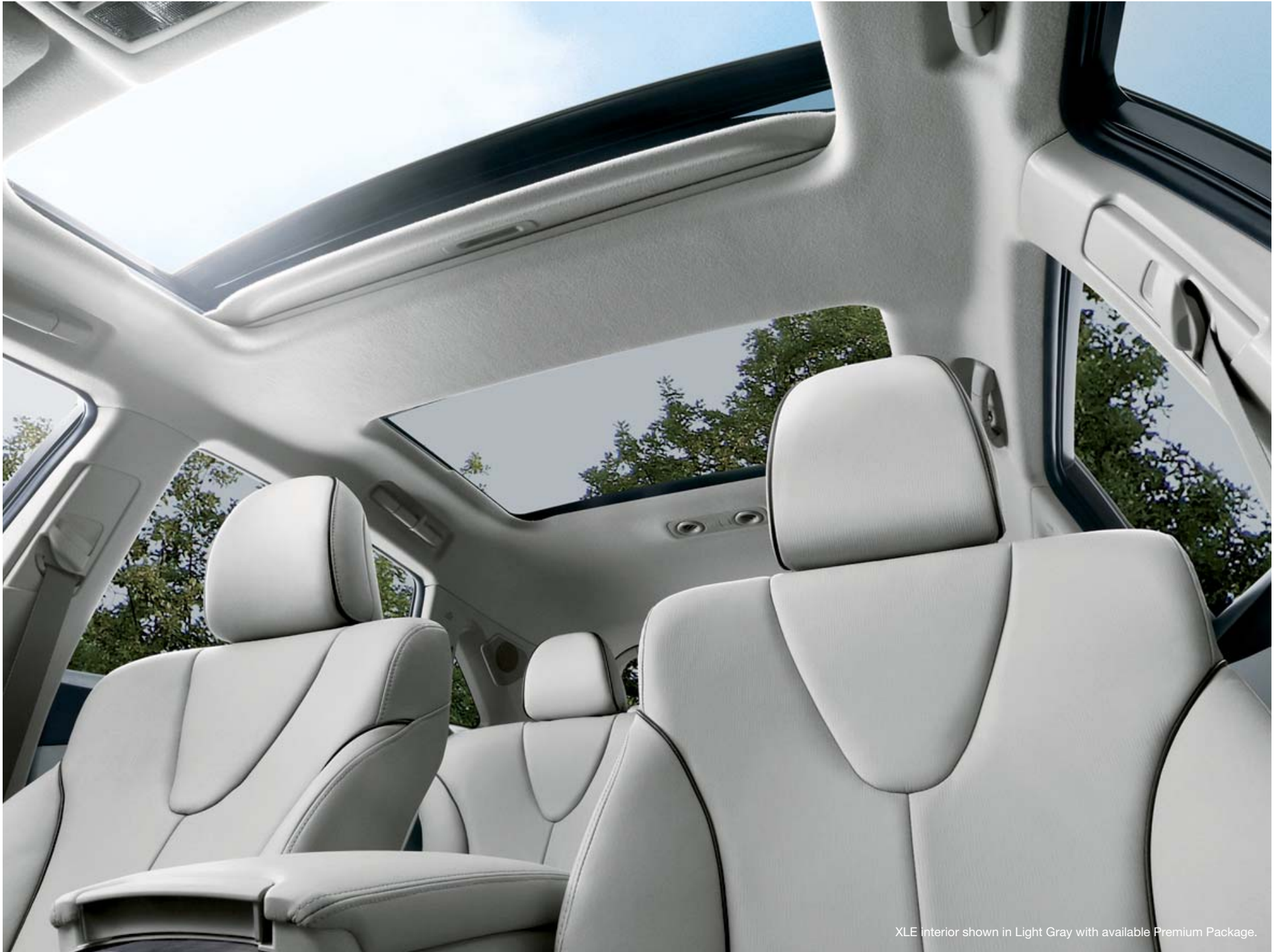
XLE interior shown in Light Gray with available Premium Package.