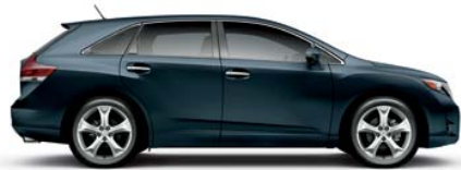
COSMIC GRAY MICA