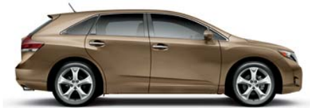
GOLDEN UMBER MICA