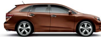
SUNSET BRONZE MICA