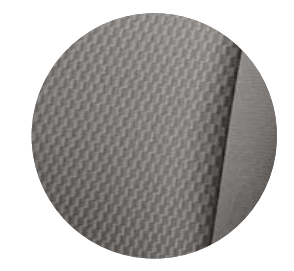
Double Cab SR5 fabric in Graphite