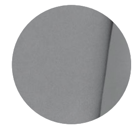
Double Cab Limited Package with SofTex® in Graphite