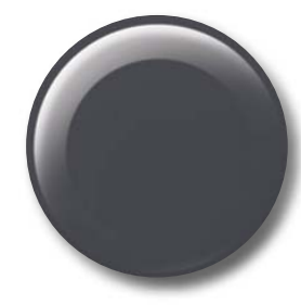
Magnetic Gray Metallic30