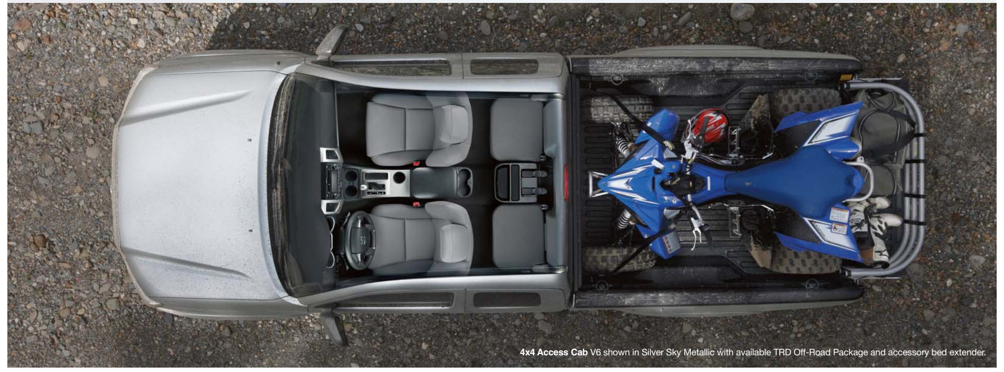
1. See footnote 8 in Disclosures section. 2. See footnote 9 in Disclosures section.