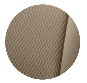
Double Cab SR5 fabric in Sand Beige