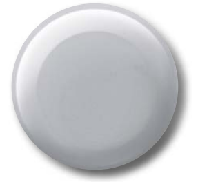
Silver Sky Metallic