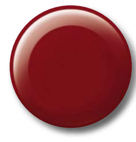
Barcelona Red Metallic