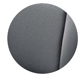
Access Cab with Base Grade fabric in Graphite