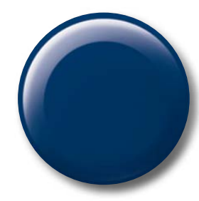
Blue Ribbon Metallic<sup>28, 29</sup>