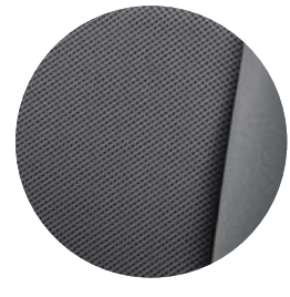
Access Cab with PreRunner Sport fabric in Graphite