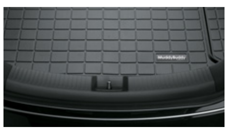
MuddyBuddy™ Trunk Liner**