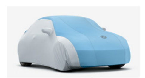
Stormproof™ Custom Car Covers**