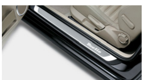
Door Sill Protection Plate