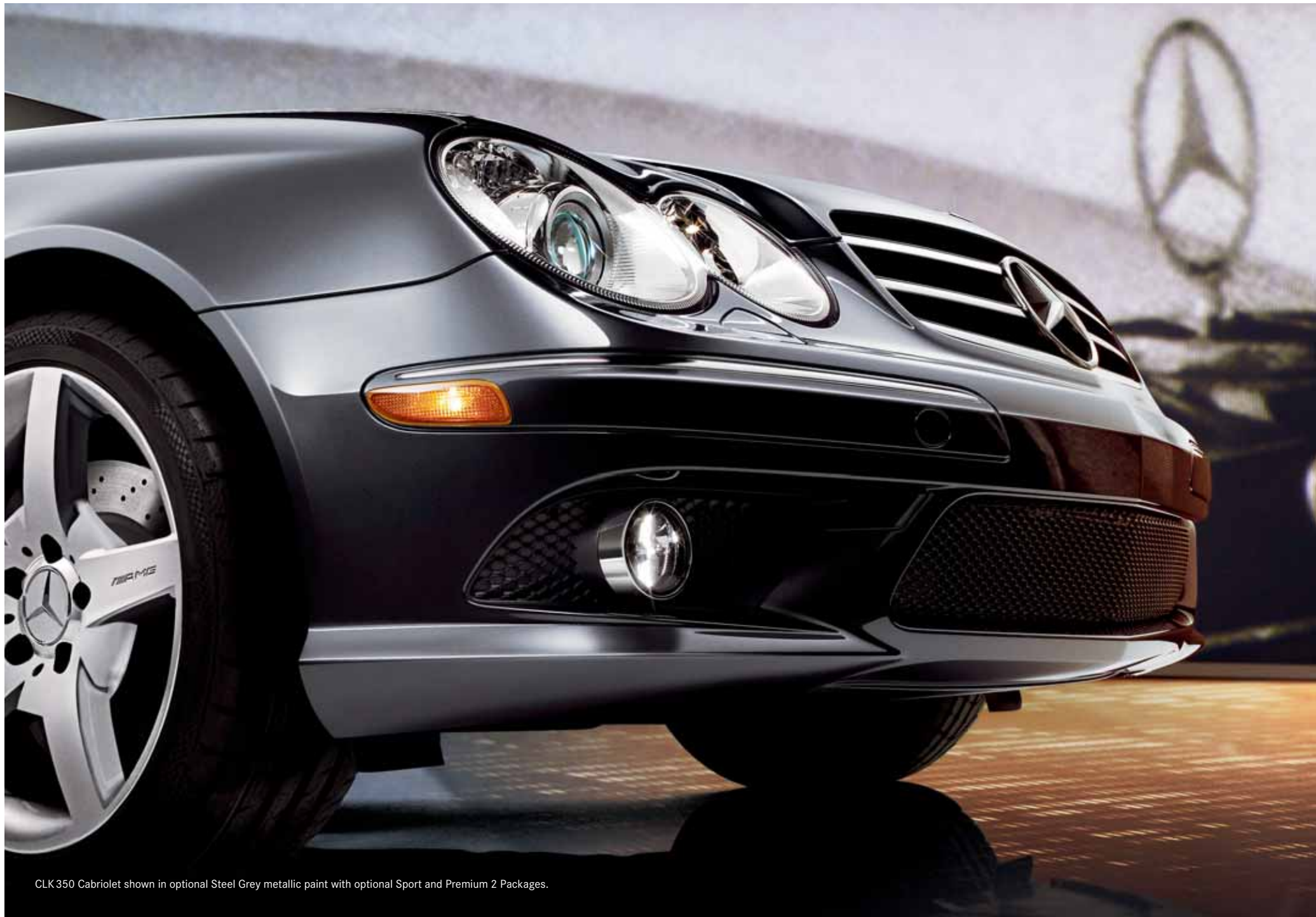
CLK350 Cabriolet shown in optional Steel Grey metallic paint with optional Sport and Premium 2 Packages.