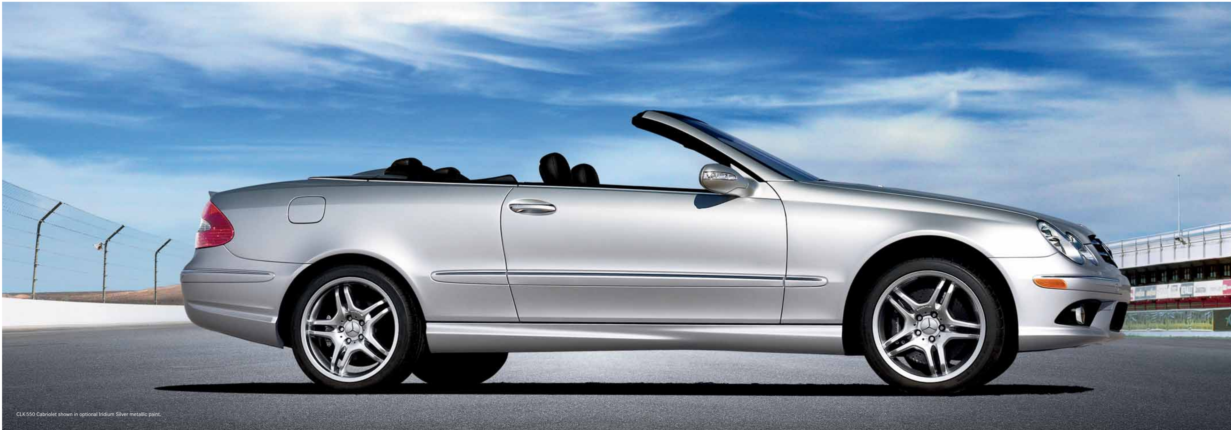
CLK550 Cabriolet shown in optional Iridium Silver metallic paint.