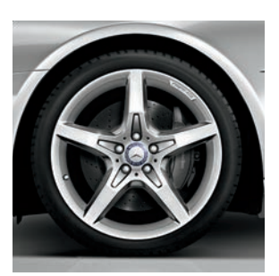
19" AMG 5-spoke (optional on SL 550 in Sport Wheel Package)