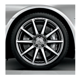
19" front/20" rear AMG forged 10-spoke, Silver (standard on SL 65 AMG, optional on SL 63 AMG)