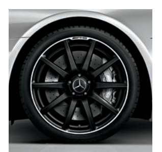
19" front/20" rear AMG forged 10-spoke, Black (optional on SL 63 AMG and SL 65 AMG)