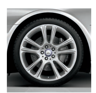
19" twin 5-spoke (optional on SL 550)