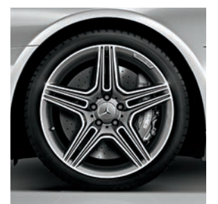
19" AMG twin 5-spoke (standard on SL 63 AMG)