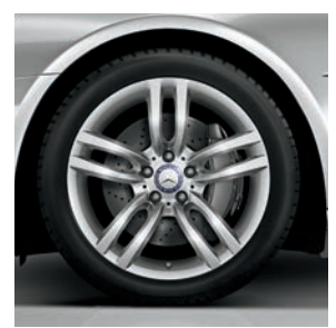
18" twin 5-spoke (standard on SL 550)