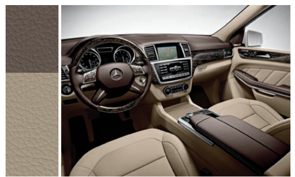
Almond Beige MB-Tex or leather (shown)