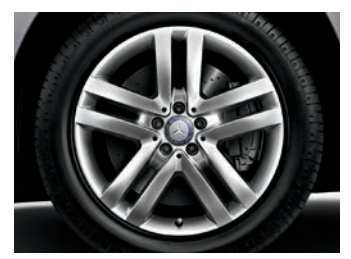
19" twin 5-spoke (GL350 BlueTEC and GL450)