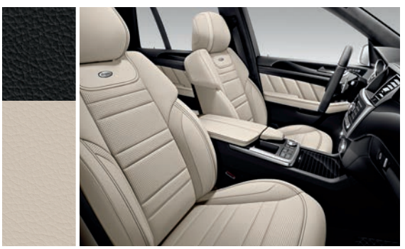
Porcelain/Black (GL 63 AMG shown)