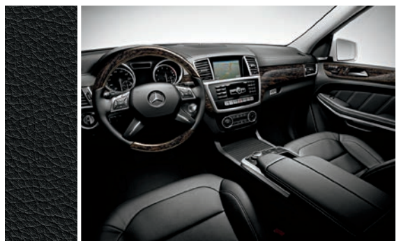
Black MB-Tex or leather (shown)