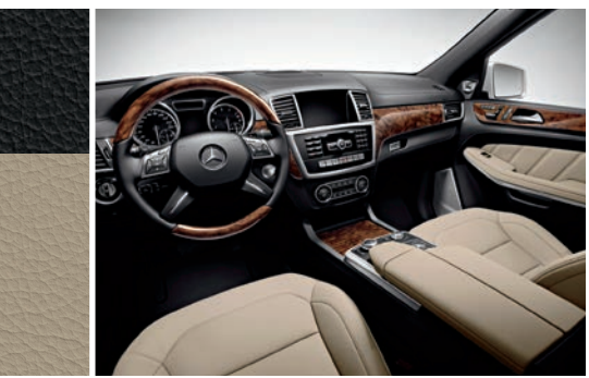
Almond Beige/Black leather