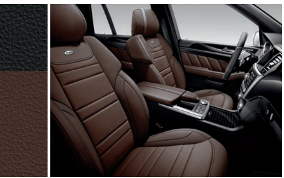
Auburn Brown/Black (GL 63 AMG shown)