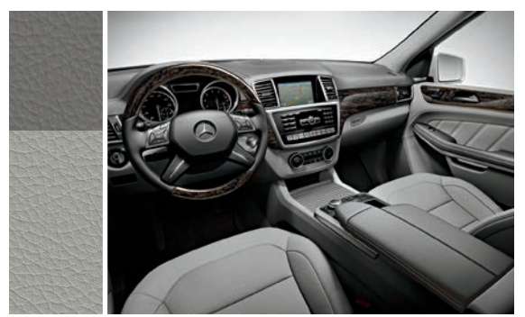
Grey MB-Tex or leather (shown)