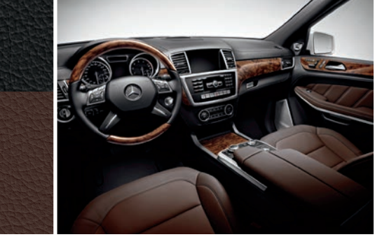
Auburn Brown/Black leather