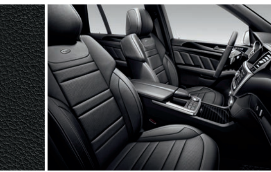
Black (GL 63 AMG shown)