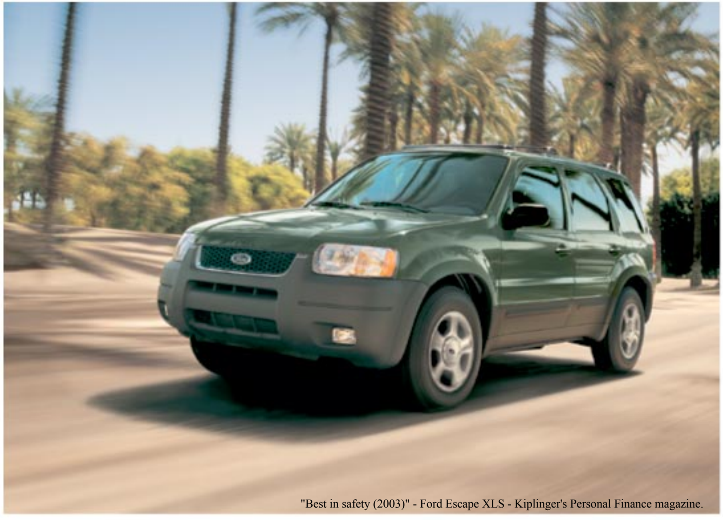
Get safely on your way, Hiller.

After earning high ratings for crash test performances, it's clear that Escape has been built with a lot more than fun in mind. The National Highway Traffic Safety Administration (NHTSA) gave Escape a five-star rating in side impact testing for both the 1st and 2nd rows, a five-star rating for driver's side front crash testing, and a four-star rating for the front passenger side.* The five-star rating is NHTSA's highest award.