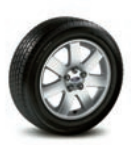
17" 7-Spoke Aluminum Wheel Standard on SEL