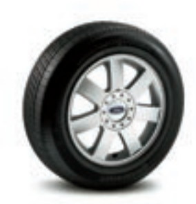
17" 7-Spoke Painted Aluminum Wheel Standard on SE