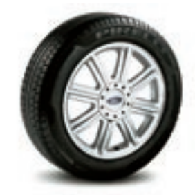
18" 8-Spoke Bright Aluminum Wheel Standard on Limited