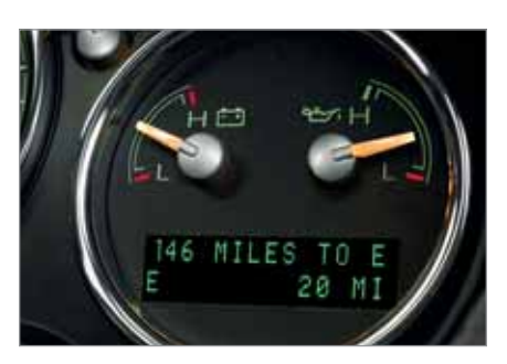
A message center in the instrument cluster keeps you up to date with vital vehicle/trip functions.