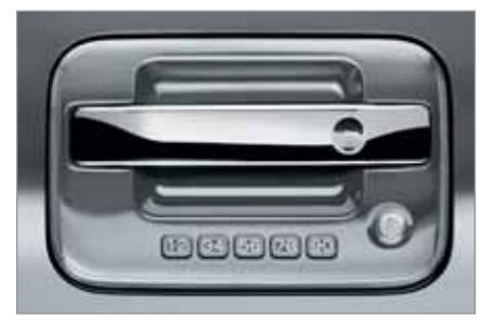
With its driver-side keyless-entry keypad, just enter your personalized code to unlock the door.