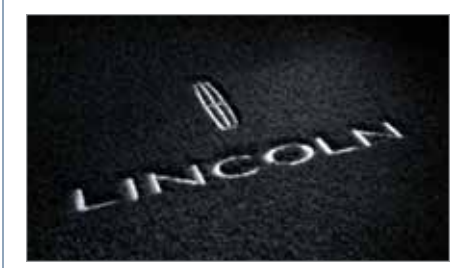
The Lincoln Star is proudly displayed in several places in Mark LT's interior, including the carpeted floor mats.

Complimentary maintenance makes driving your Lincoln even more of a pleasure. Simply bring it to an authorized Lincoln service center, and scheduled maintenance will be performed at no charge throughout your first year of ownership or 12,000 miles, whichever comes first. Additional peace of mind comes from a 4-year/50,000-mile bumper-to-bumper New Vehicle Limited Warranty that covers repair, replacement or adjustment of parts at no additional cost, as well as a 6-year/70,000-mile powertrain limited warranty which features no deductible and is fully transferable. And Roadside Assistance for 6 years or 70,000 miles provides the security of knowing that help may be only a phone call away should you run out of fuel, lock yourself out of the vehicle or need towing. Your Lincoln Mercury Dealer will provide complete details on all of these privileges.