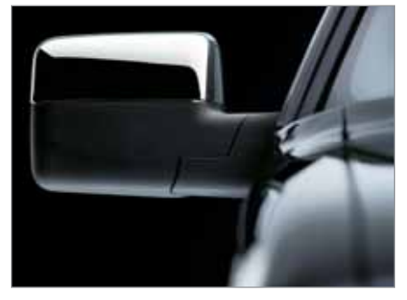
Power, heated, chrome-capped sideview mirrors feature turn-signal indicators that let others know of your lane-change intentions.