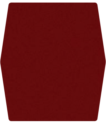
Bronze Fire Metallic