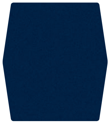
Midnight Sapphire Metallic