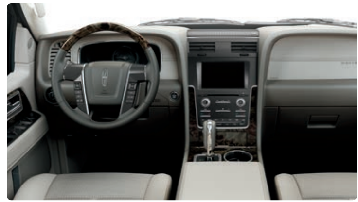
Medium Light Stone Leather