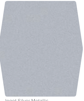
Ingot Silver Metallic