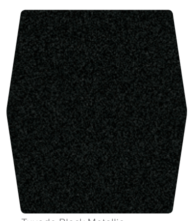
Tuxedo Black Metallic