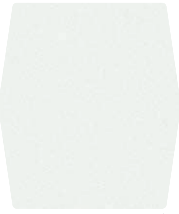
White Platinum Metallic Tri-coat<sup>1</sup>