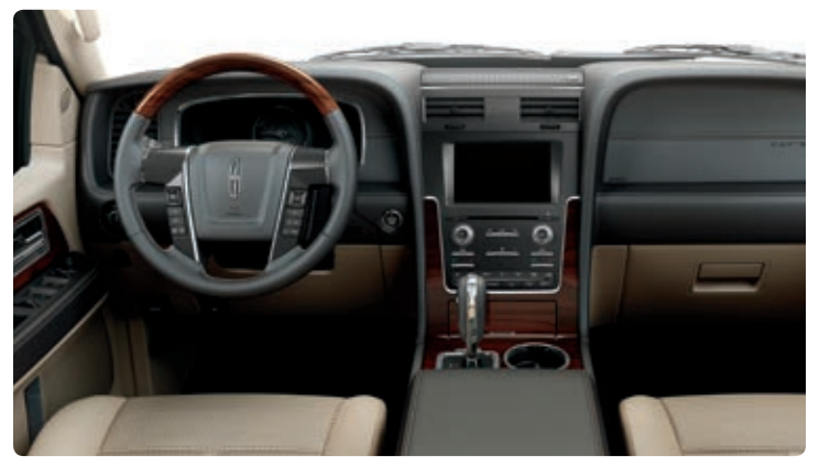
Trevino Premium Dune Leather Not available with Midnight Sapphire Metallic