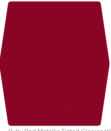
Ruby Red Metallic Tinted Clearcoat<sup>1</sup>