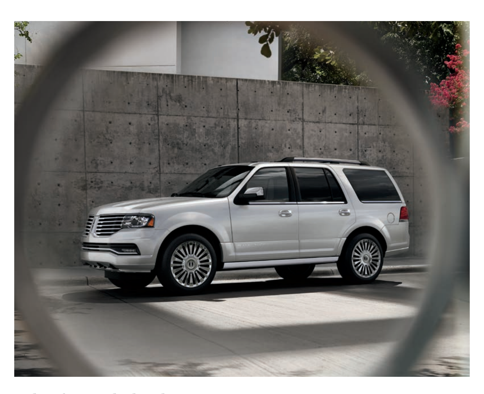
A clear focus on high tech.