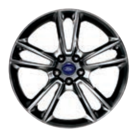
19" H-Spoke Dark Stainless-Painted Aluminum Optional

<sup>1</sup>SYNC Services varies by trim level and model year and may require a subscription. Traffic alerts and turn-by-turn directions available in select markets. Message and data rates may apply. Ford Motor Company reserves the right to change or discontinue this product service at any time without prior notification or incurring any future obligation. <sup>2</sup>Ford does not recommend using summer tires when temperatures drop to approximately 40°F or below (depending on tire wear and environmental conditions) or in snow/ice conditions. If the vehicle must be driven in these conditions, Ford recommends using all-season or winter tires.