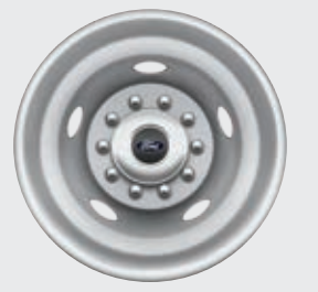
19.5" Argent-Painted Steel with Stainless Steel Covers Optional: XL & XLT F-450/F-550