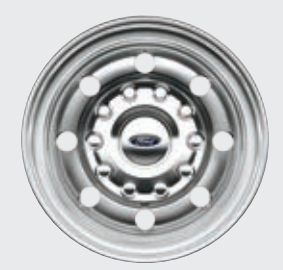
19.5" Polished Forged-Aluminum with Bright Center Cap Optional: XLT F-450/F-550 Standard: LARIAT F-450/F-550

New Vehicle Limited Warranty. We want your Ford F-Series Super Duty<sup>®</sup> Chassis Cab ownership experience to be the best it can be. Under this warranty, your new vehicle comes with 3-year/36,000-mile bumper-tobumper coverage, 5-year/60,000-mile Powertrain Warranty coverage, 5-year/60,000-mile safety restraint coverage, and 5-year/unlimited-mile corrosion (perforation) coverage – all with no deductible. The Ford 6.7L Power Stroke<sup>®</sup> diesel engine gets 5-year/100,000-mile warranty coverage. Please ask your Ford Dealer for a copy of this limited warranty.