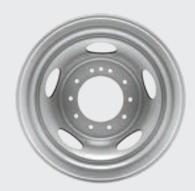
19.5" Argent-Painted Steel Standard: XL & XLT F-450/F-550