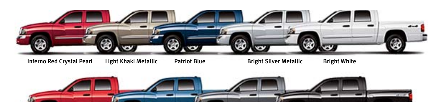
Flame Red Electric Blue Mineral Gray Metallic Brilliant Black