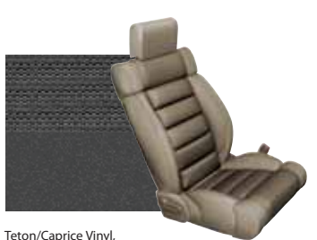
Teton/Caprice Vinyl, Two-Tone seat shown in Medium Khaki, also available in Medium Slate Gray Standard on Wrangler X