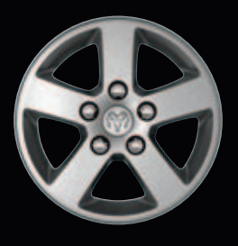
16-inch aluminum wheel (Optional on SE)