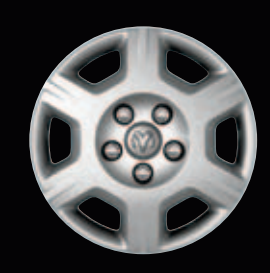
16-inch steel wheel with wheel cover (Standard on SE)