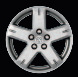
19-inch painted cast aluminum wheel (Standard on SXT AWD and R/T, Optional on SXT FWD)