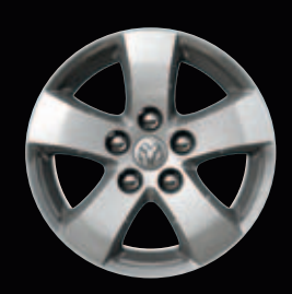
17-inch aluminum wheel (Standard on SXT FWD)