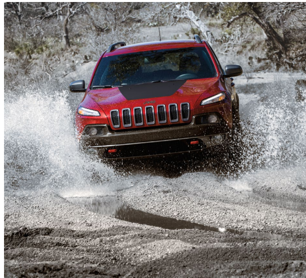
Jeep Cherokee 2014