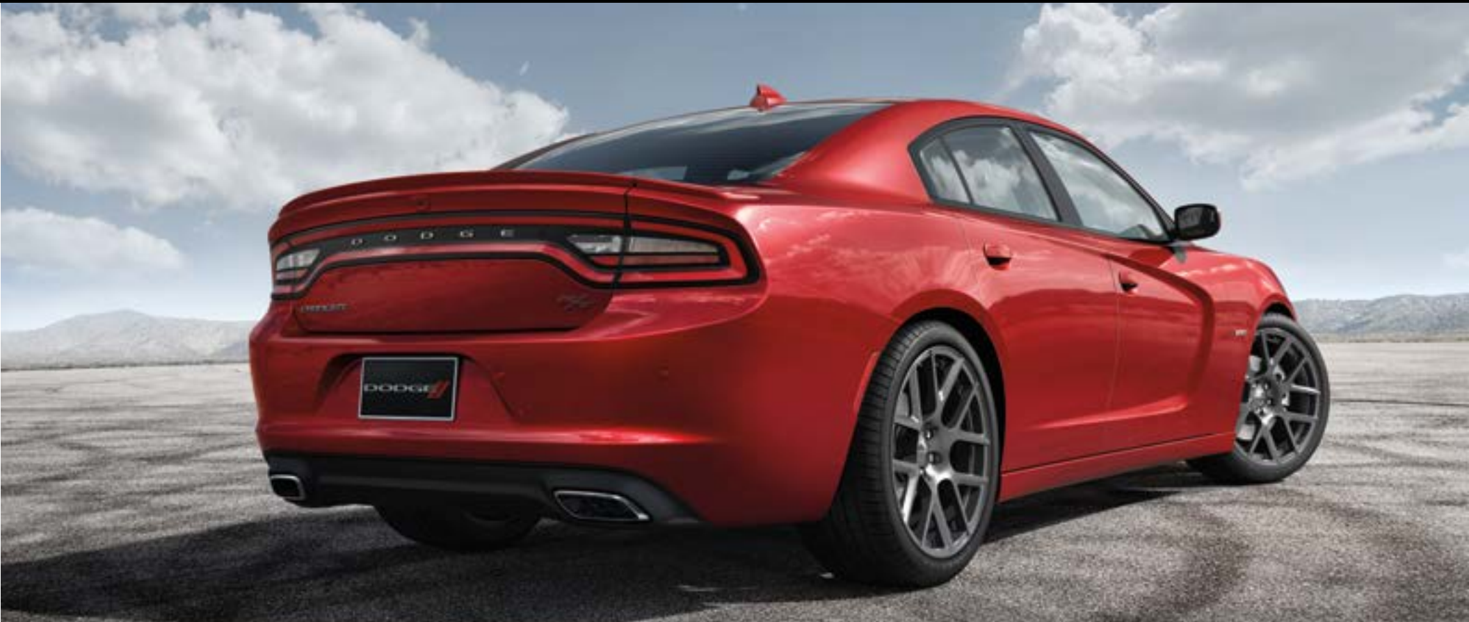
CHARGER R/T ROAD & TRACK IN REDLINE RED // // // //