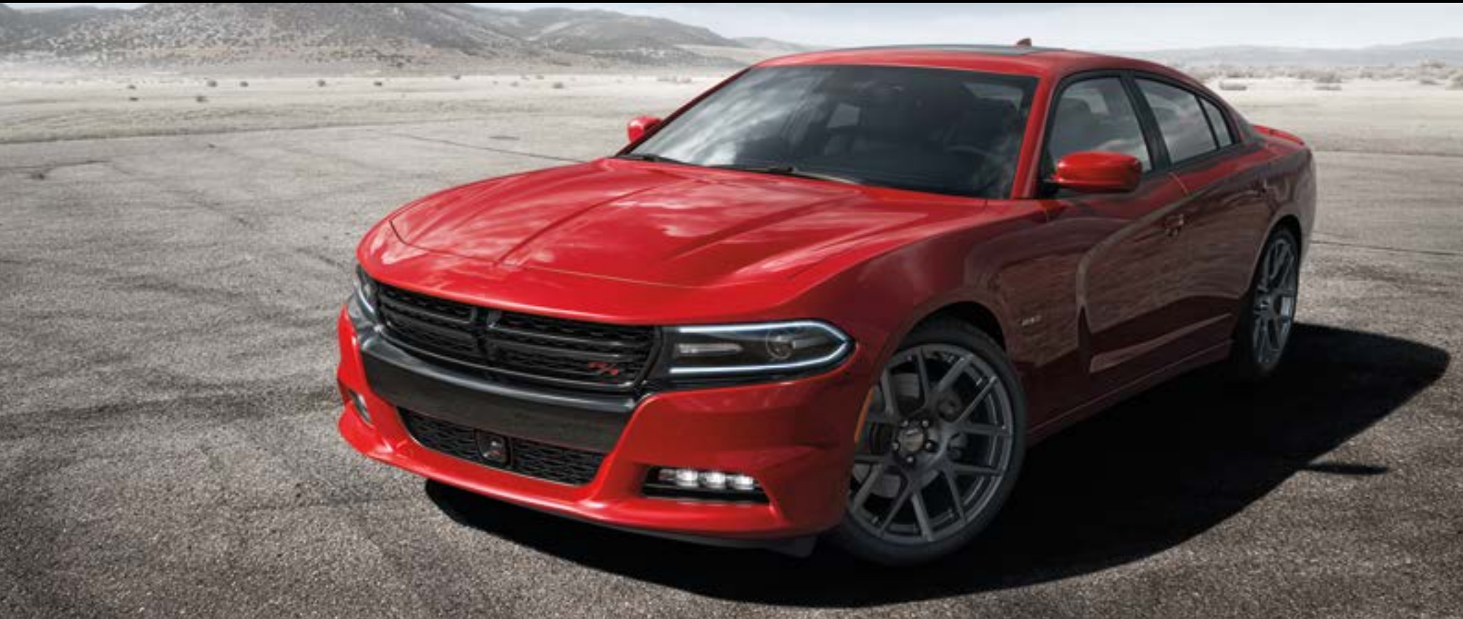
CHARGER R/T ROAD & TRACK IN REDLINE RED //