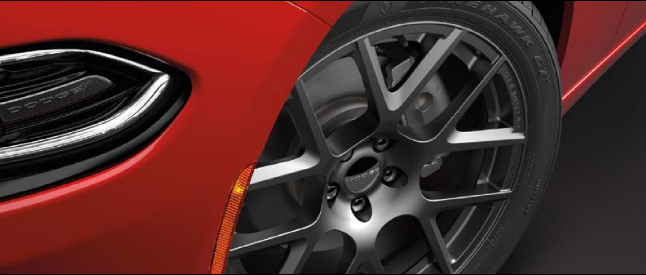
20x9-INCH FORGED ALUMINUM WHEELS //