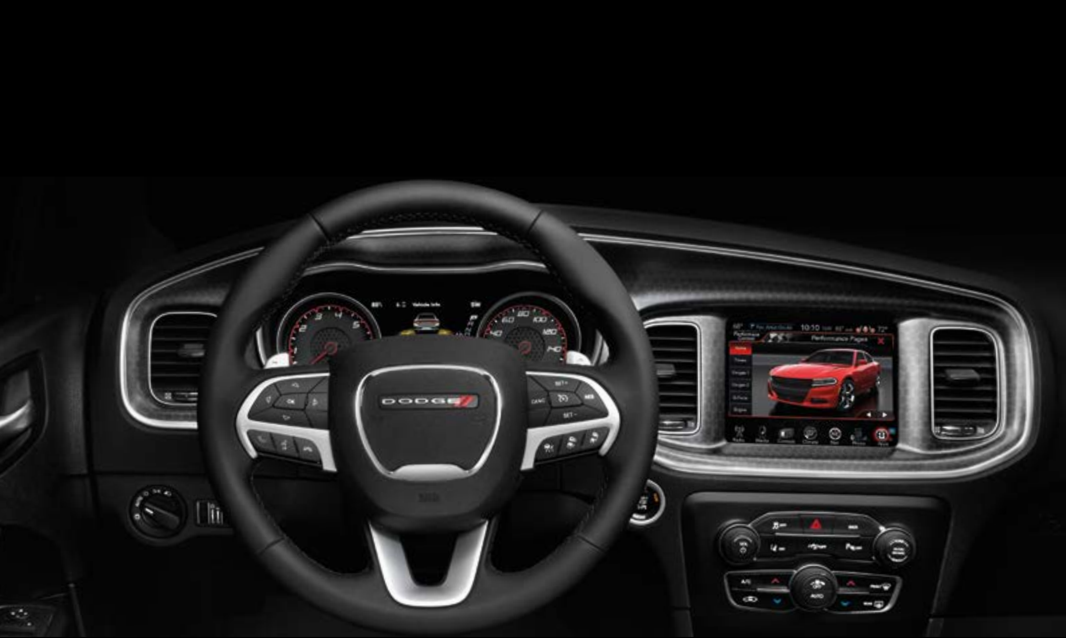
NEW CHARGER INTERIOR WITH AVAILABLE 8.4-INCH TOUCHSCREEN //