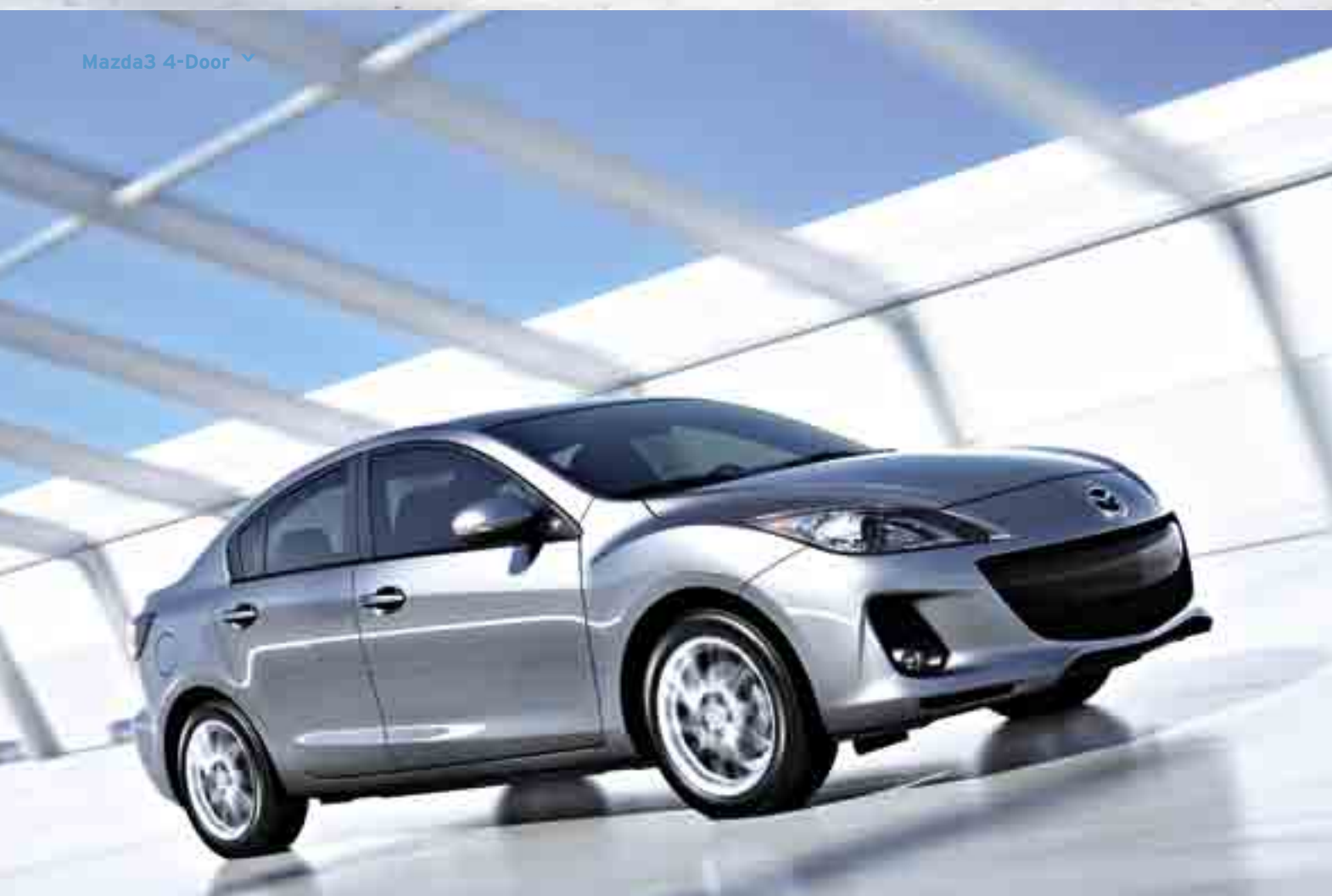
Mazda3 4-Door v