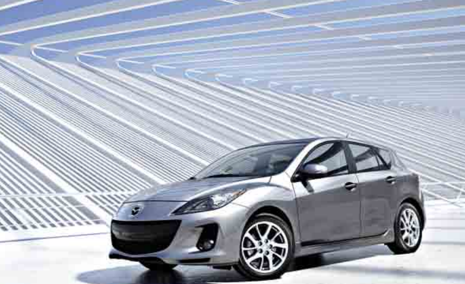
Mazda3 5-Door ^