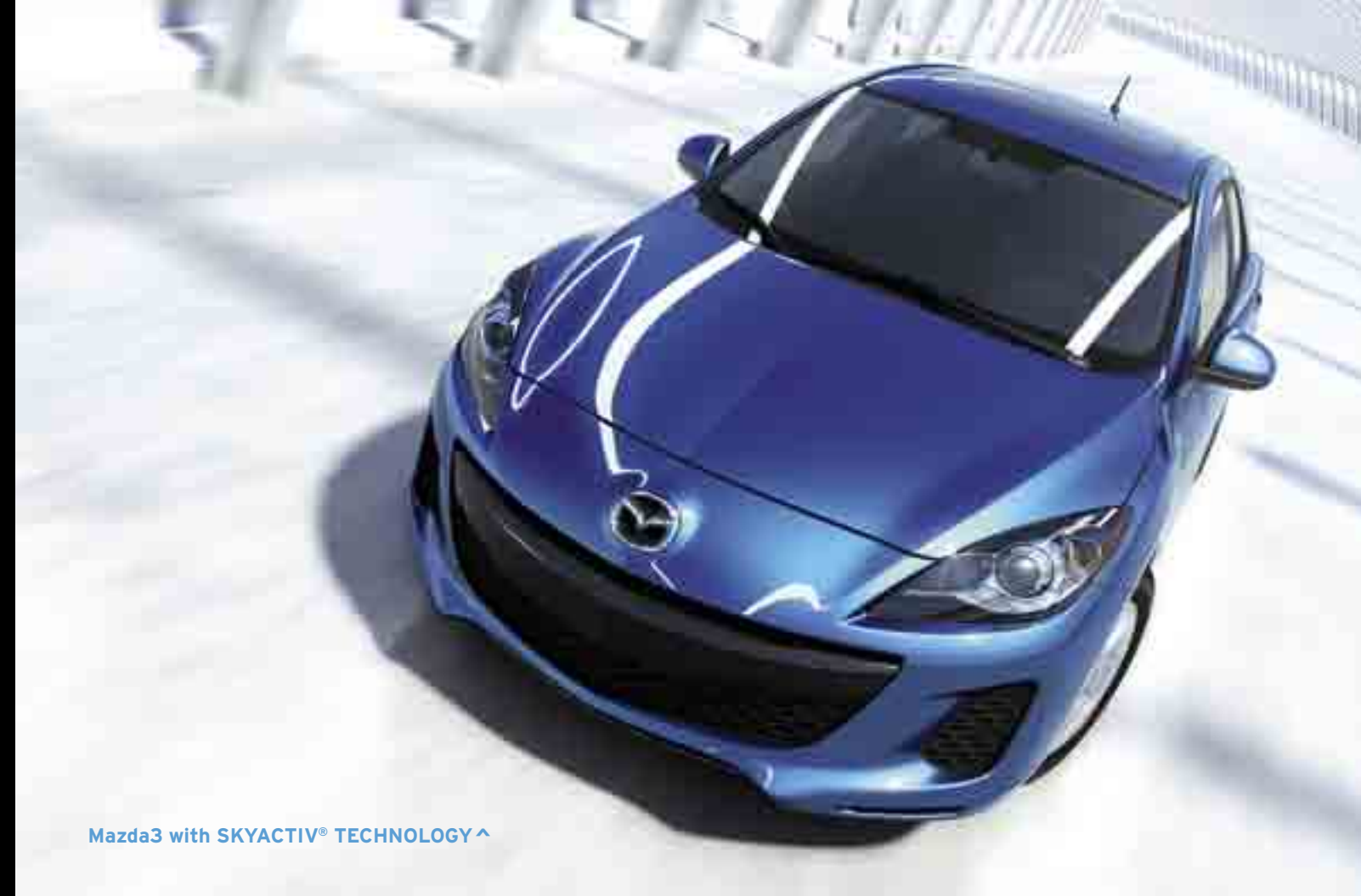
Mazda3 with SKYACTIV® TECHNOLOGY ^