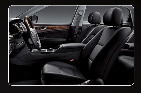
JET BLACK LEATHER / WALNUT WOOD