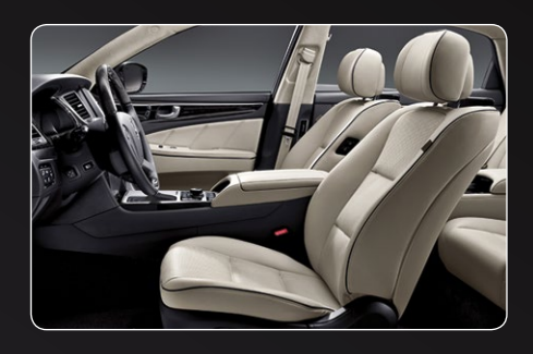
IVORY LEATHER / ASH WOOD