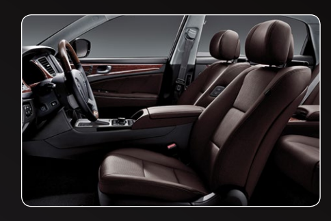
SADDLE BROWN LEATHER / MADRONA WOOD