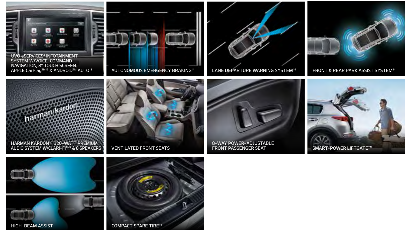
UVO eSERVICES 4 INFOTAINMENT SYSTEM W/VOICE-COMMAND NAVIGATION, 8" TOUCH SCREEN, APPLE CarPlay ™12 & ANDROID ™ AUTO 13