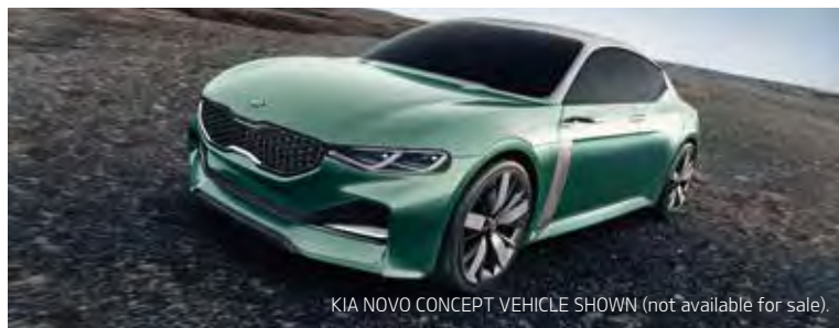
KIA NOVO CONCEPT VEHICLE SHOWN (not available for sale).