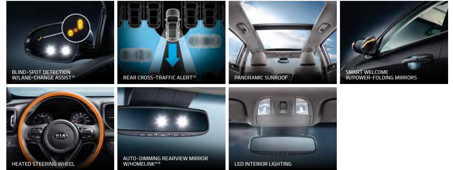
BLIND-SPOT DETECTION W/LANE-CHANGE ASSIST 14