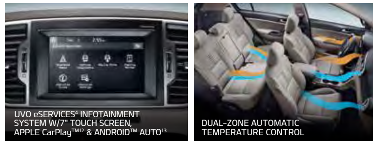
UVO eSERVICES 4 INFOTAINMENT SYSTEM W/7" TOUCH SCREEN, APPLE CarPlay ™12 & ANDROID ™ AUTO 13