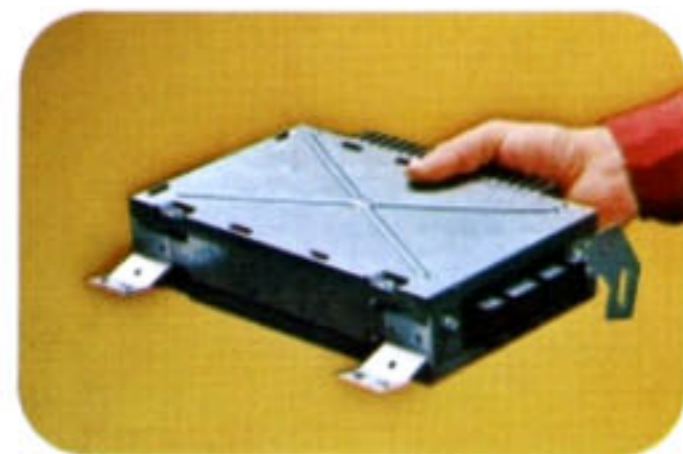
On-board computer for EFI.

This is the first American car to combine international size, styling and performance with Cadillac comfort and convenience. For impressive maneuverability and ease of parking, Seville is about 18 inches shorter than full-size Cadillacs. Yet, Seville is designed for interior roominess and comfort. Electronic-Fuel-Injected Engine. Seville is the first American production car to offer a 5.7 Litre (350 cu. in.) Electronic-Fuel-Injected Engine as standard equipment. This advanced EFI system is designed for quick response, fast starting, smooth engine idle and few required maintenance operations. There is no carburetor maintenance because there is no carburetor. As you drive, Seville's on-board analog computer is constantly fed data on various engine factors. It calculates each requirement, then signals the injectors