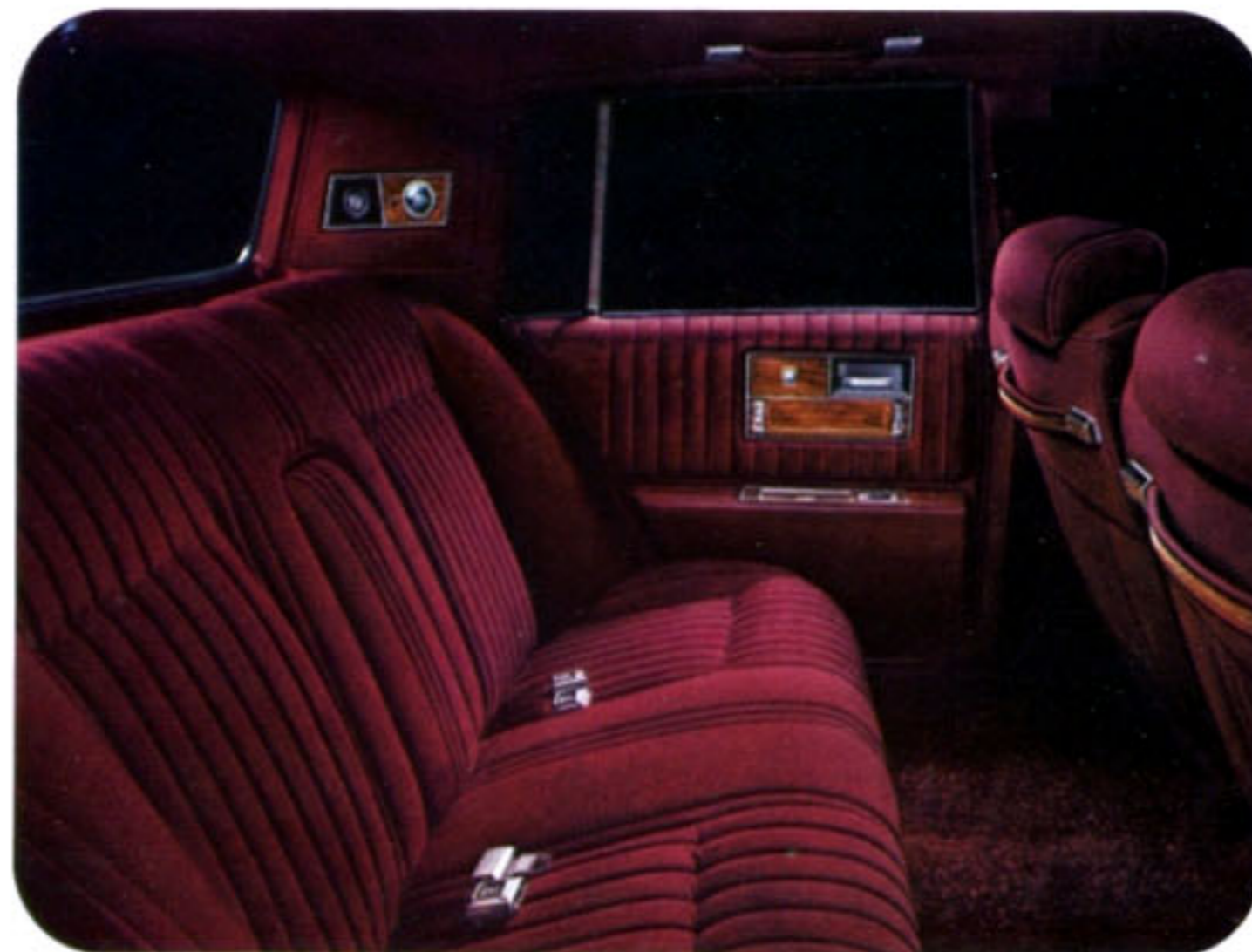
Dover Cloth in Claret.

radial tires. And Automatic Level Control to help keep the car level with changing loads. Large-diameter Pliacell shock absorbers—as on the Cadillac Limousines—contribute to Seville's impressive ride. To help keep outside noise outside, sound-absorbing padding and molded acoustic insulators are strategically applied in key areas. Super-soft weather stripping on doors helps reduce wind noise. And the one-piece instrument panel cover helps reduce squeaks and rattles. The luxury inside. Seville interiors are understated—elegant in their simplicity—with almost every luxury feature standard. There's Automatic Climate Control. Dual Comfort 50/50 front seats. Power windows and door locks. Tilt and Telescope Steering Wheel. AM/FM Signal-Seeking Stereo Radio with Scanner. And many more.