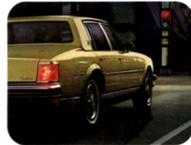
Four-wheel disc brakes.

Seville has been enhanced by a new, more distinctive grille. And you may now select either a vinyl top or the stylish simplicity of an all-metal roof. All other styling remains happily unchanged. An American Success Story. Few cars in so short a period of time have so captured the imagination of the motoring public as this car. In fact, Seville is meeting the needs of more and more particular people—making it one of the most successful new luxury cars of this, or any other decade.