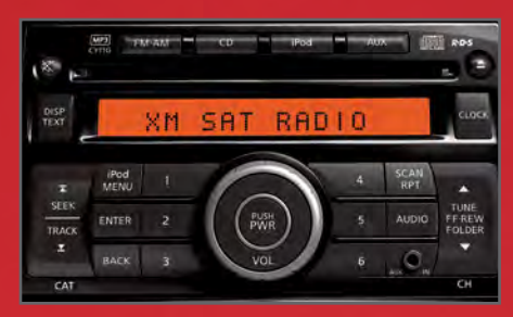
SIRIUSXM® SATELLITE RADIO

With a standard Bluetooth® Handsfree Phone System, JUKE® can store your phone's contacts so you can use the voice-activation feature to make calls by name.³