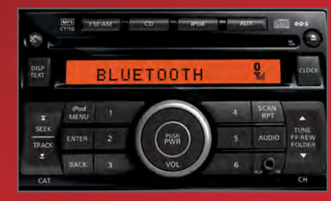
BLUETOOTH® HANDS-FREE PHONE SYSTEM

The optional Rockford Fosgate® ecoPUNCH™ Premium Audio System consumes less juice than a conventional amplifier system. Six high-efficiency speakers and a powerful 8" long-throw subwoofer work together to produce dynamic, hard-hitting sound.