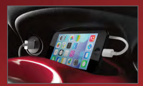
USB iPOD® CONNECTIVITY

Make easy work out of finding that new club. Dial in your favorite artist or call ahead with both hands on the wheel. In JUKE,® you're always ready to rock.