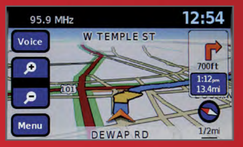
NISSAN NAVIGATION SYSTEM

Fully integrated into the JUKE® audio system, SiriusXM® Satellite Radio offers more than 130 channels of music, talk, sports, and more, all in rich, digital-quality sound.4