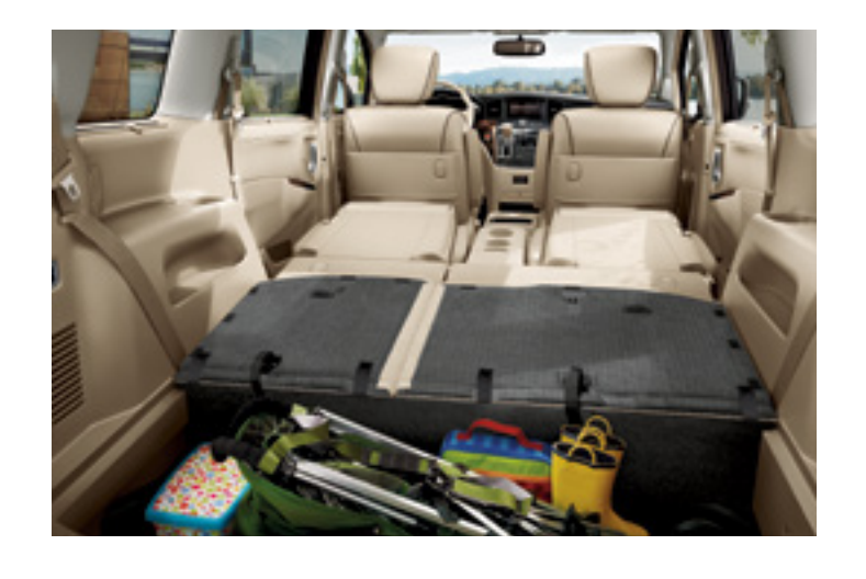
All seats down. Go full cargo mode, while Quest®'s practical and permanent rear storage well is always at the ready.