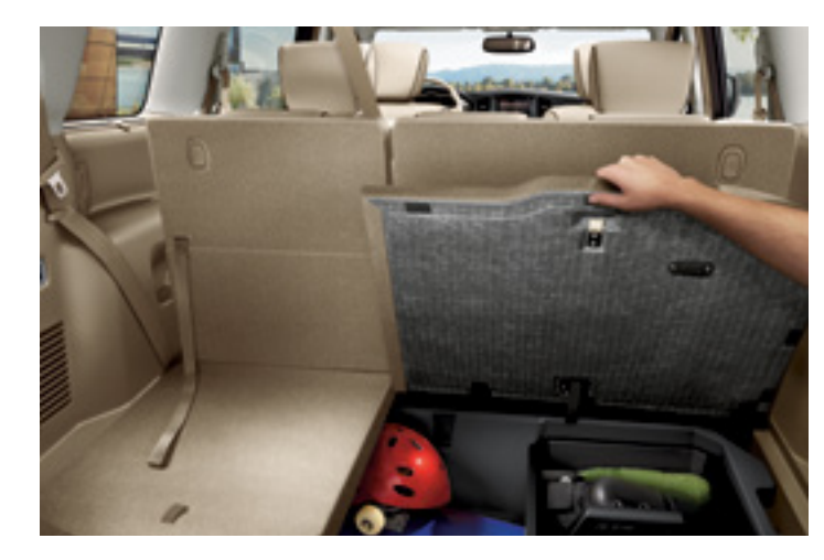
All seats up. Seven on board and you still have room for gear. The permanent storage well has two separate lids. You can keep a flat cargo floor on one side, and leave the other lid open to carry taller things. Accessory Cargo Organizer Shown.

In Quest,* not only does the second row fold flat, forward, and out of the way, so does the third. So unlike other minivans, instead of stowing seats, the cargo well behind the third row is a permanent place to put whatever you like.