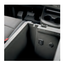
12-V and 120-V power outlets in the center console help keep you charged up.